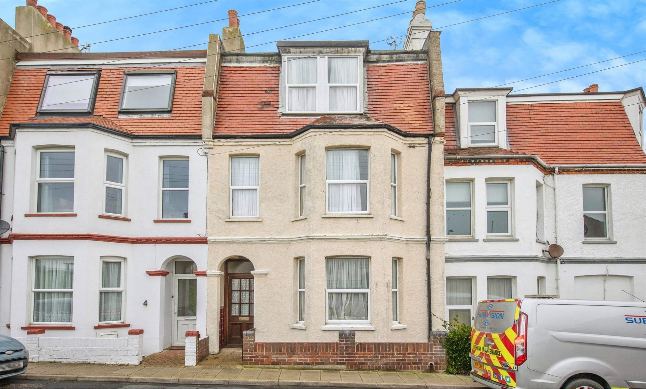
New Pier Street, Walton On The Naze CO14 8EB