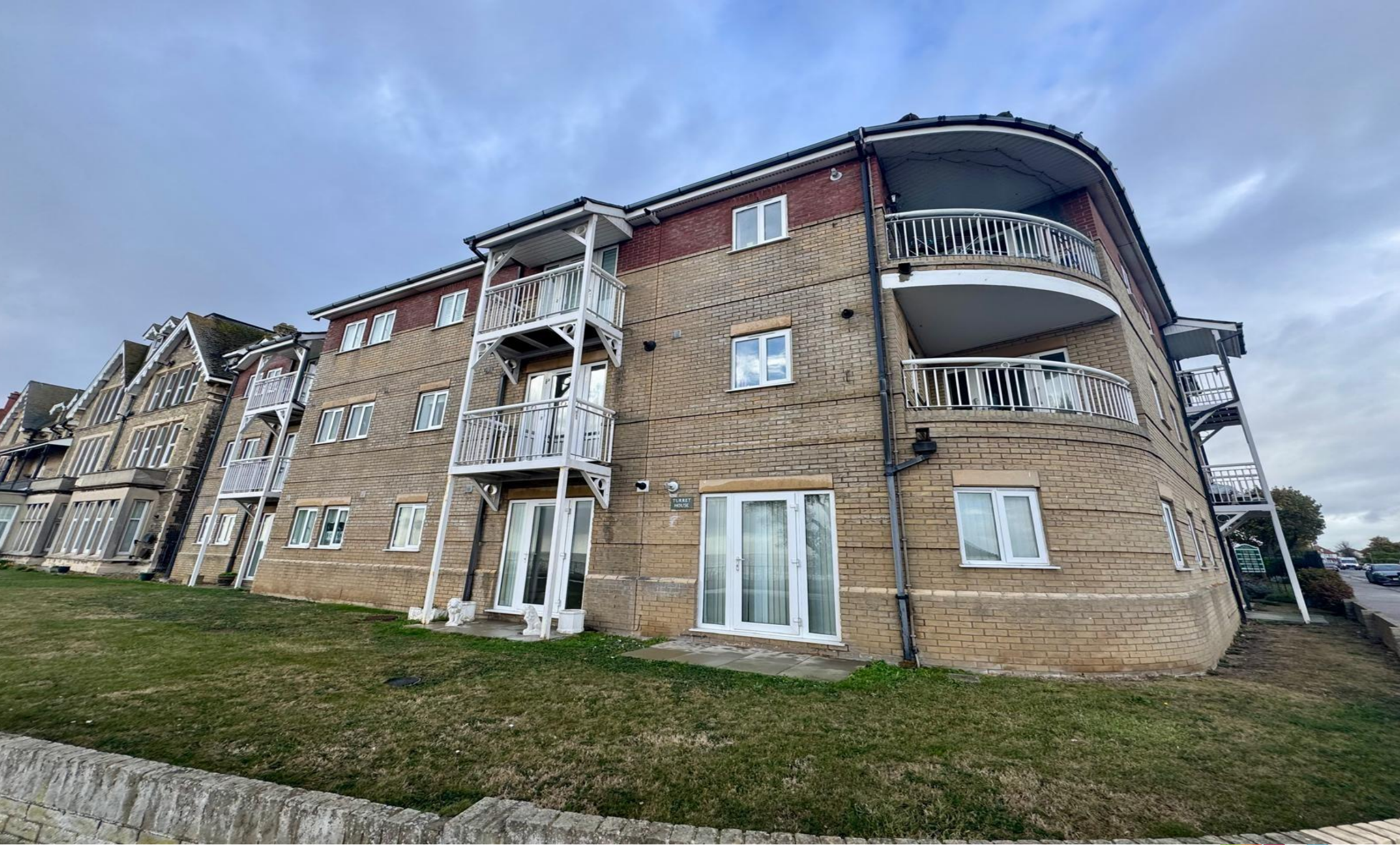
Turret House Vista Road, Clacton-On-Sea CO15 6DF