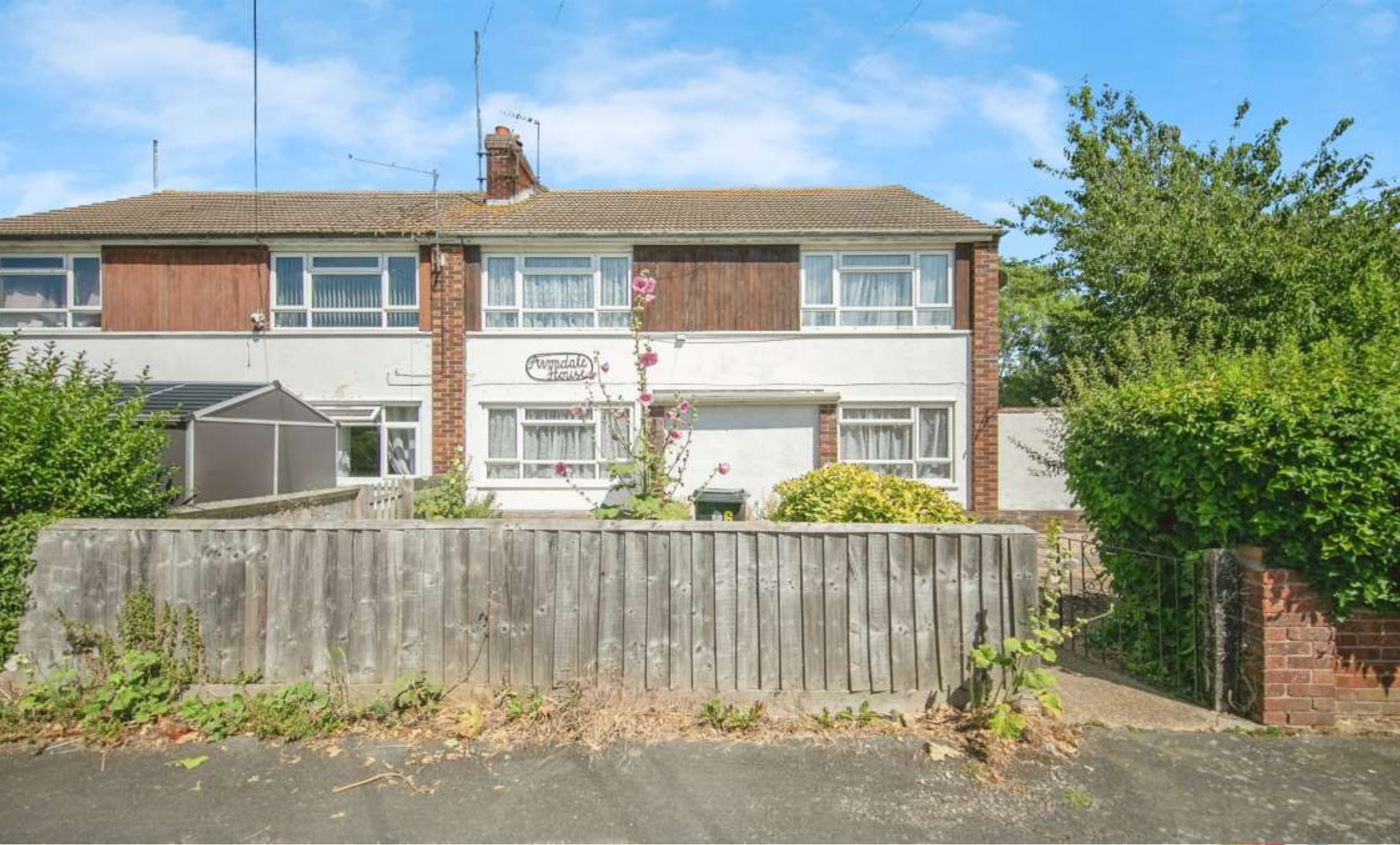
Avondale House Avondale Road, Clacton-On-Sea CO15 6ES