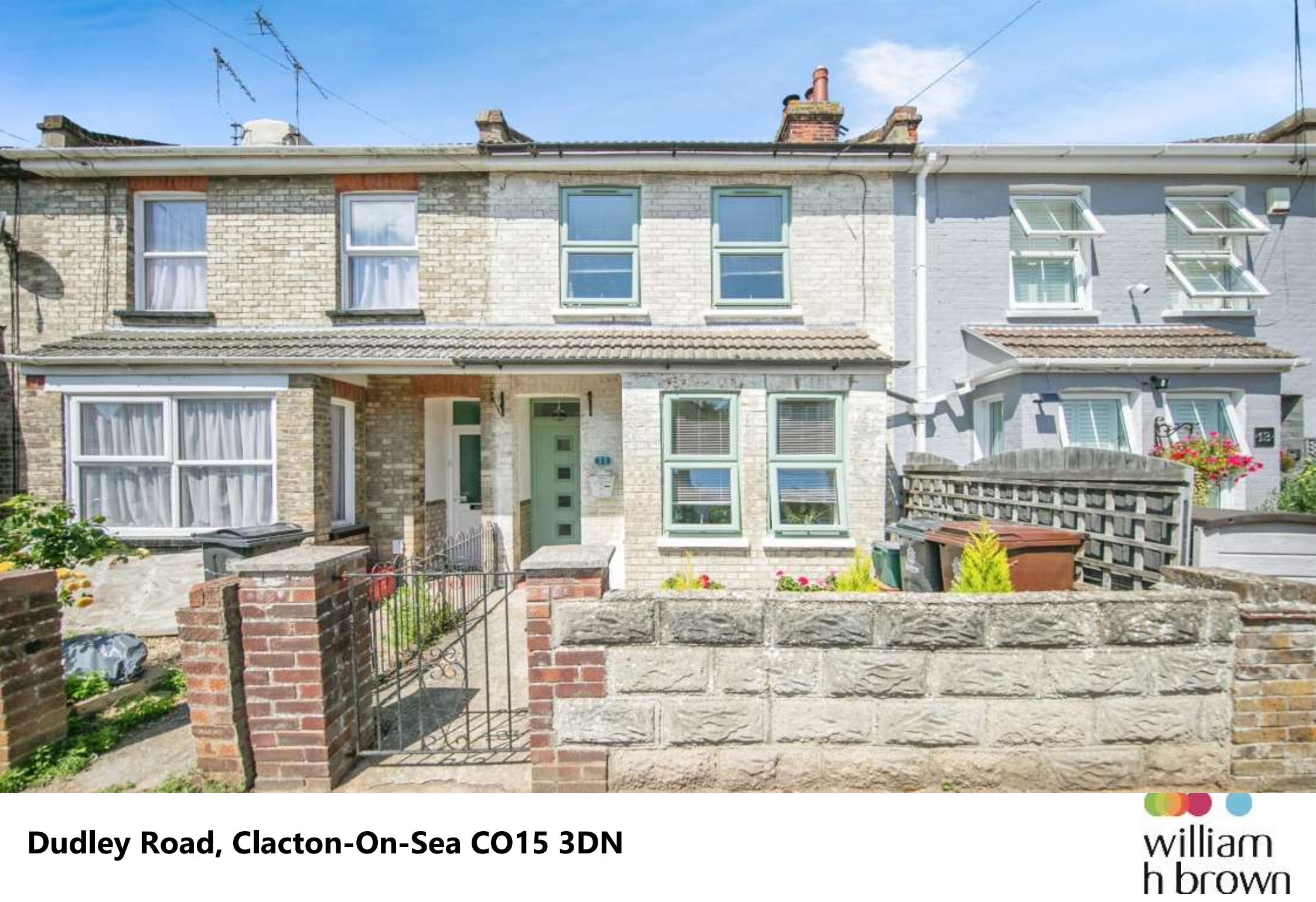
Dudley Road, Clacton-On-Sea CO15 3DN