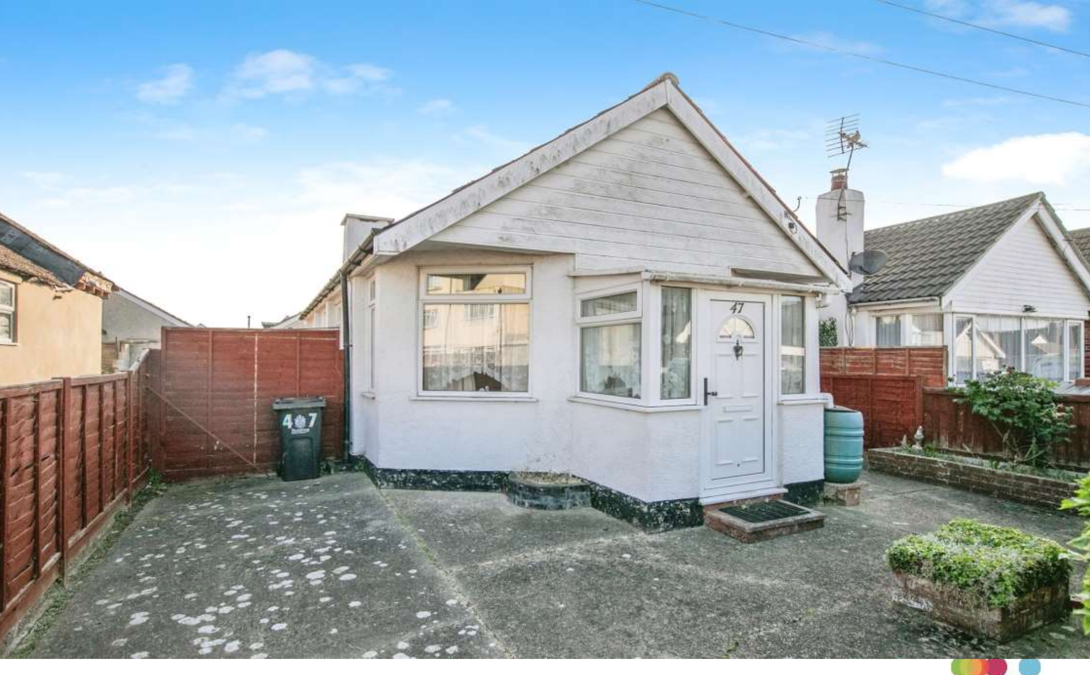
Rosemary Way, Jaywick CLACTON-ON-SEA CO15 2SD