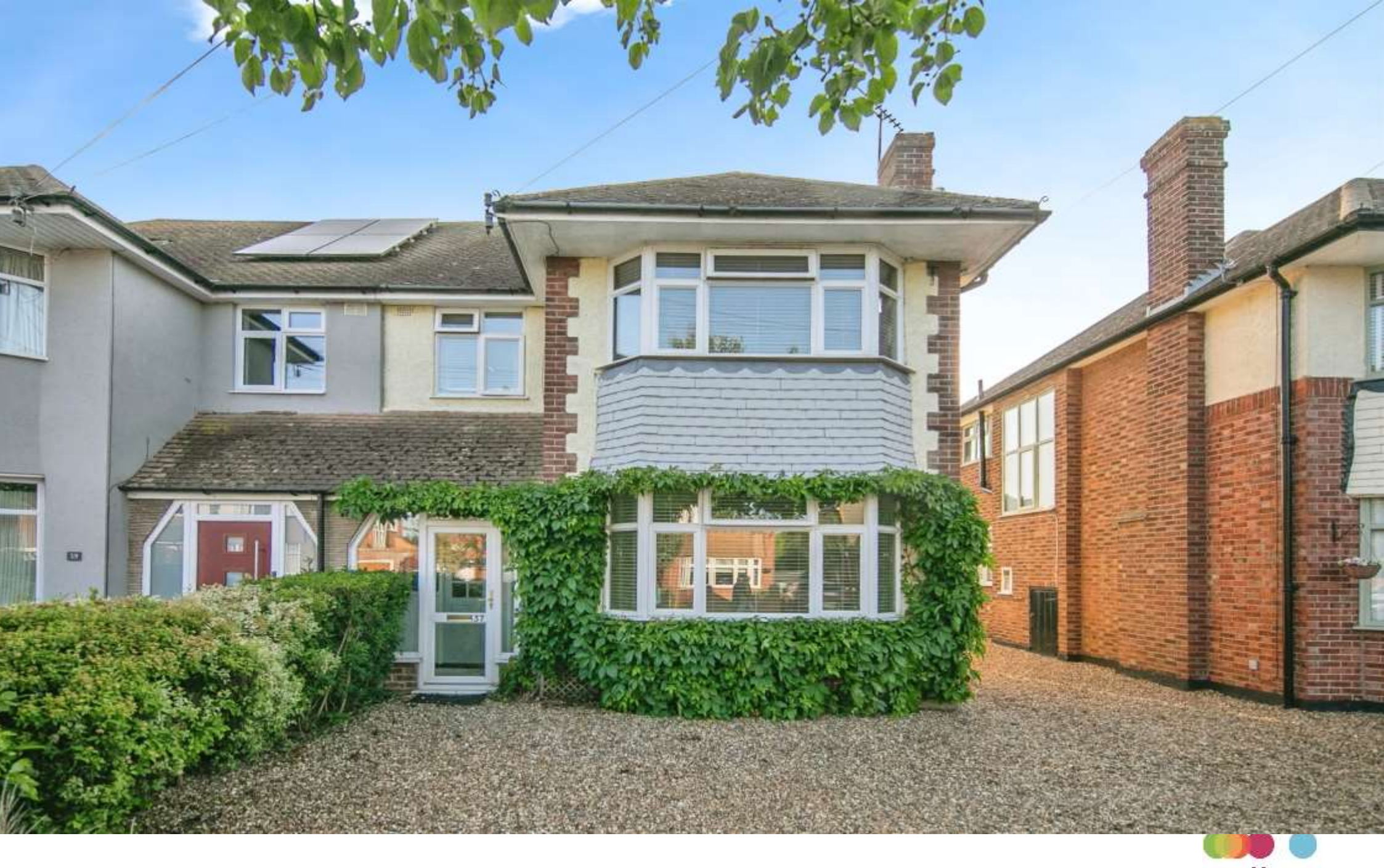
Turpins Avenue, Holland On Sea Clacton-On-Sea CO15 5HE