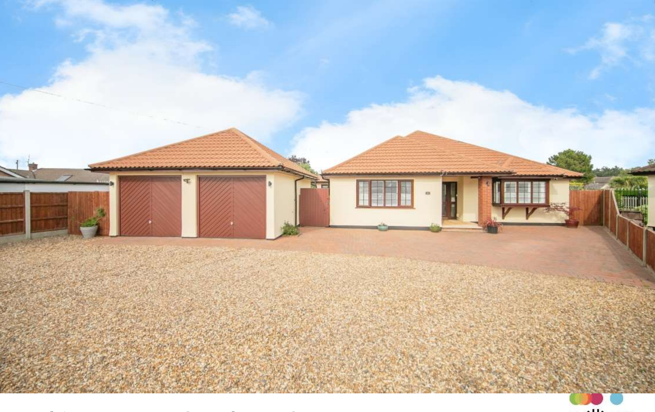
Hazelview Rectory Road, Weeley Heath CLACTON-ON-SEA CO16 9AY