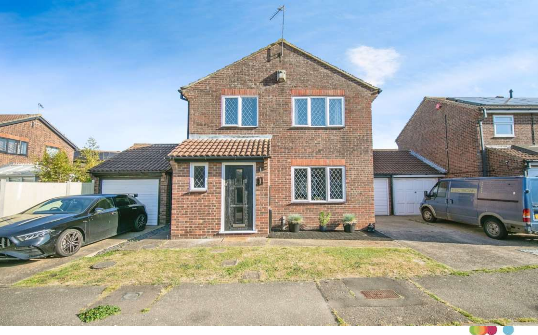
Ashtead Close, Clacton-On-Sea CO16 8YZ