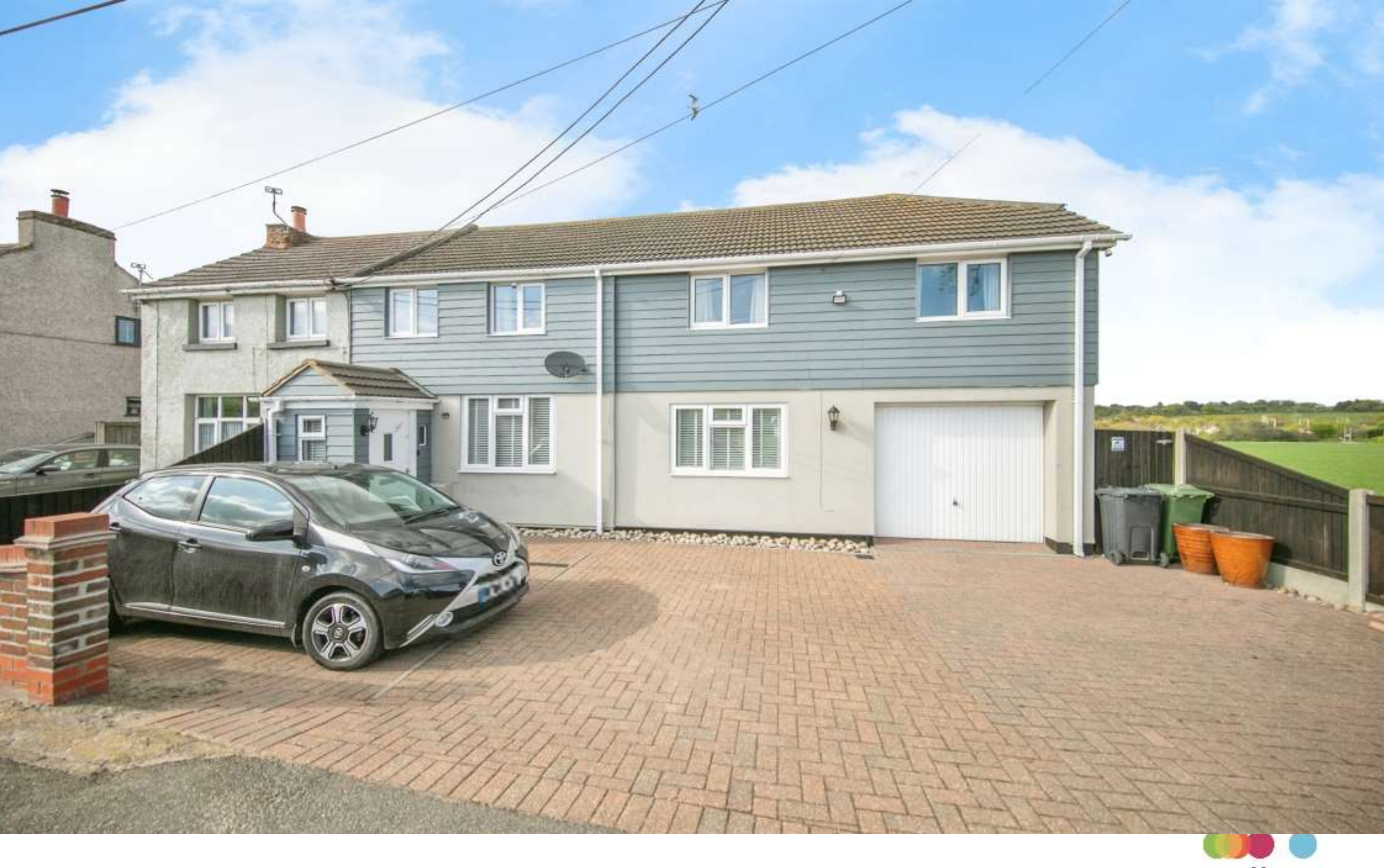
Harwich Road, Little Clacton CLACTON-ON-SEA CO16 9PZ