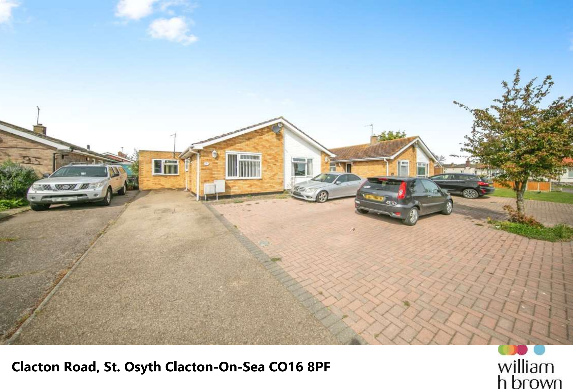
Clacton Road, St. Osyth Clacton-On-Sea CO16 8PF