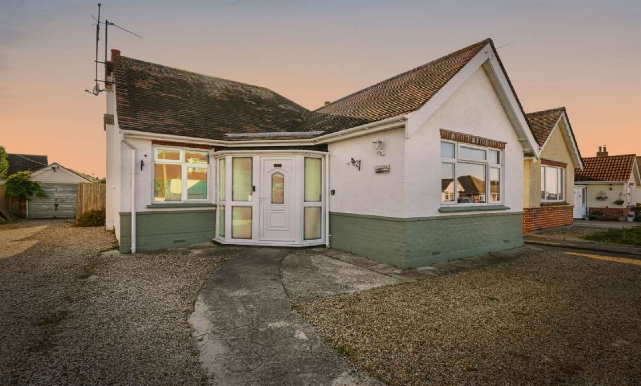
Merrilees Crescent, Holland-On-Sea Clacton-On-Sea CO15 5XY