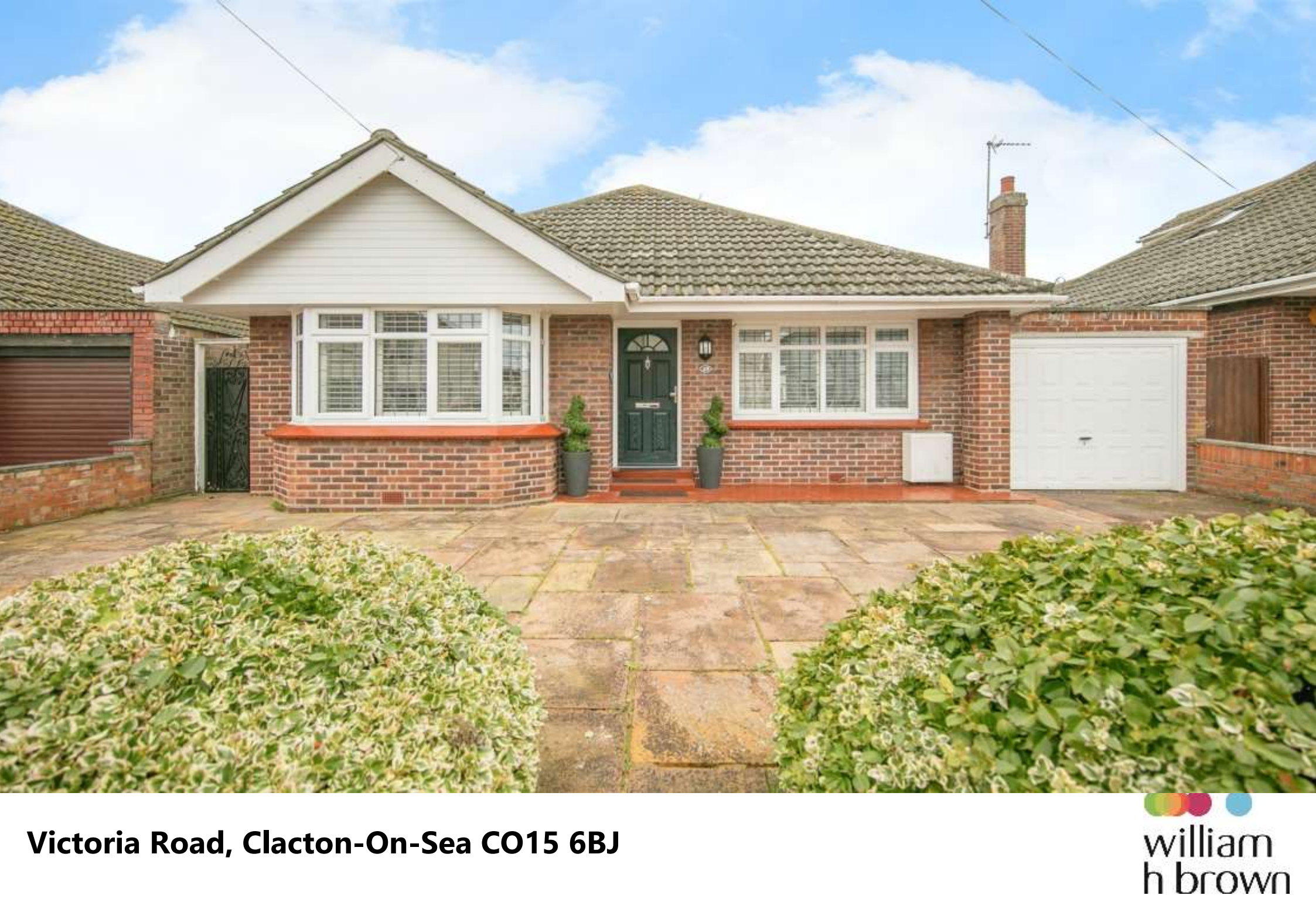
Victoria Road, Clacton-On-Sea CO15 6BJ