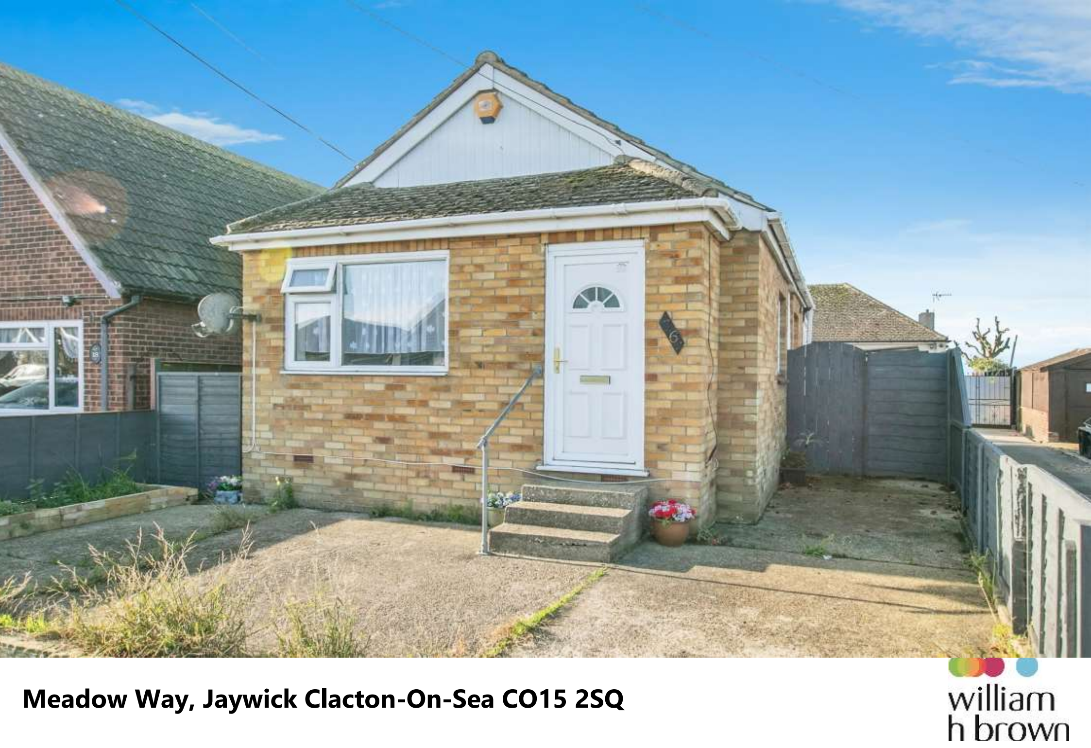
Meadow Way, Jaywick Clacton-On-Sea CO15 2SQ