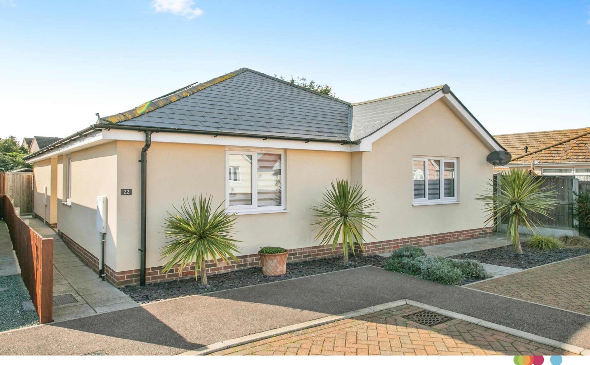
Springfield Meadows, Little Clacton Clacton-On-Sea CO16 9EB