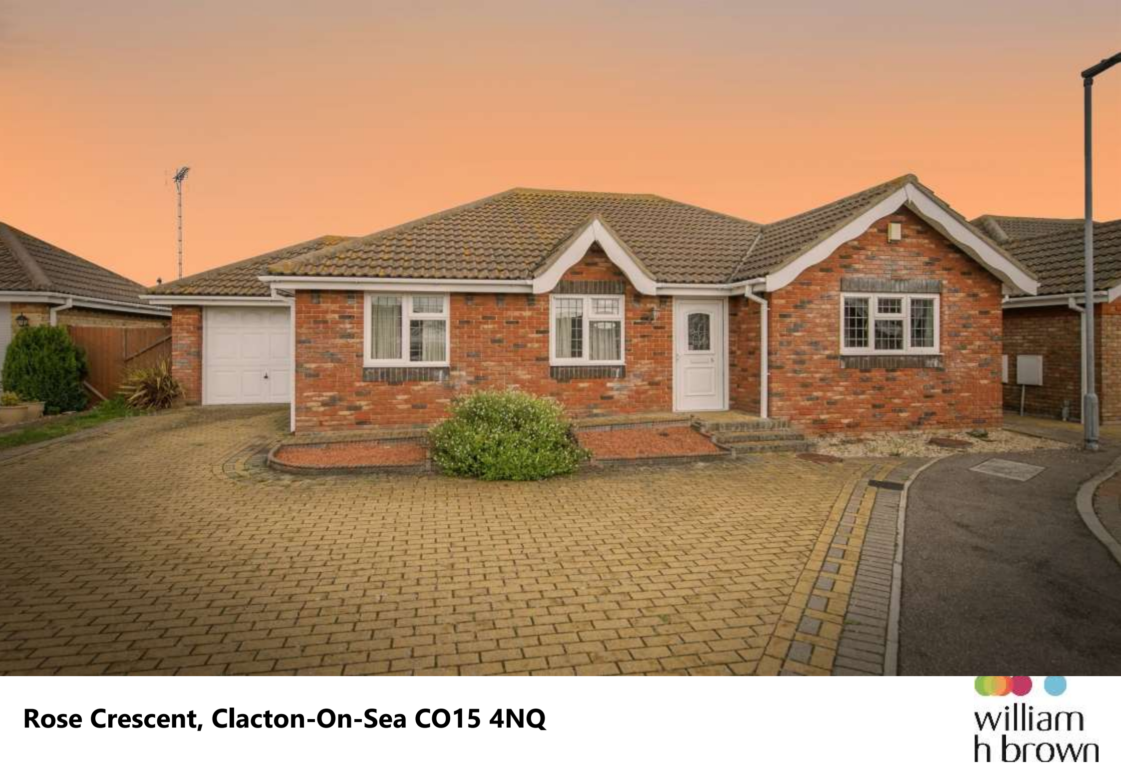
Rose Crescent, Clacton-On-Sea CO15 4NQ