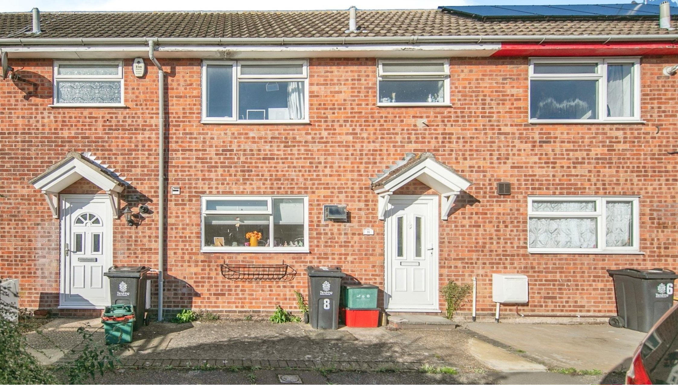
Salvia Close, Clacton-On-Sea CO16 7BZ