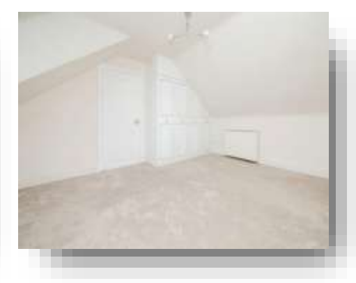
Spring Chapel Lr Google