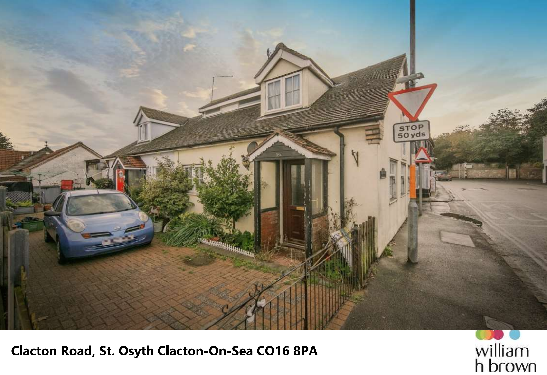
Clacton Road, St. Osyth Clacton-On-Sea CO16 8PA