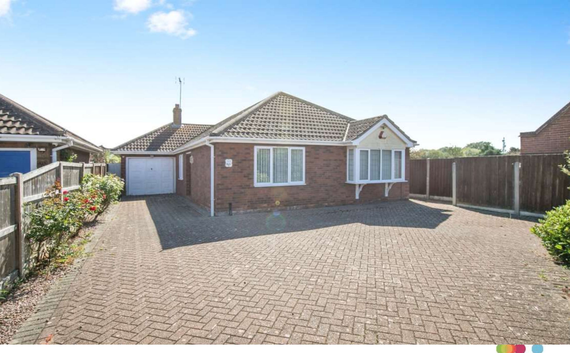
Burrs Road, Clacton-On-Sea CO15 4LF