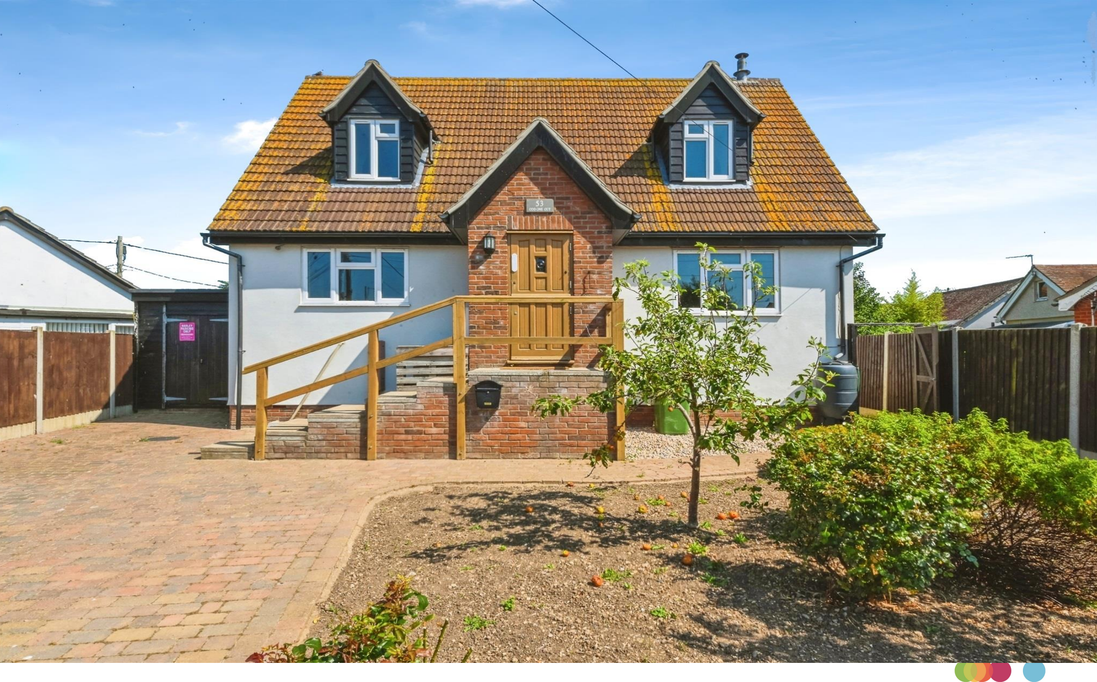
Fern Way, Jaywick Clacton-On-Sea CO15 2JB