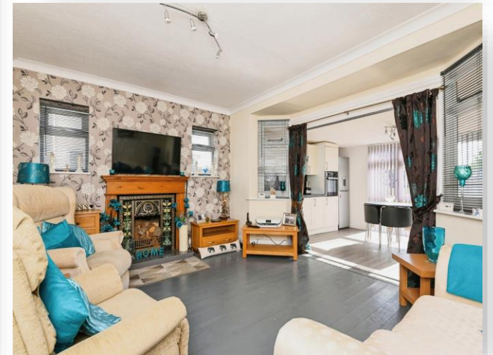
Merrilees Crescent, Holland-On-Sea Clacton-On-Sea CO15 5XY