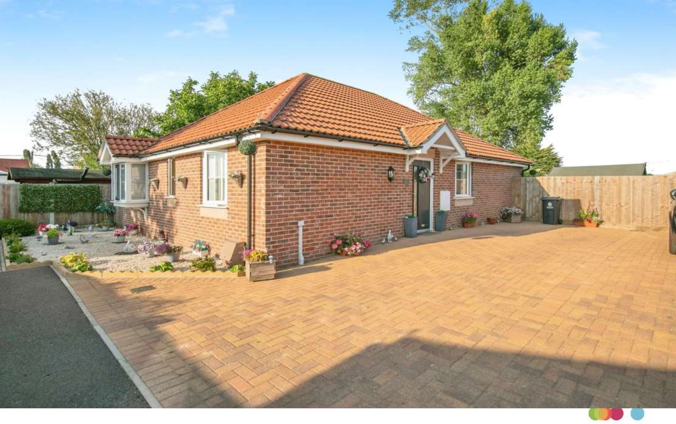
Whitegates Court, Little Clacton Clacton-On-Sea CO16 9FD