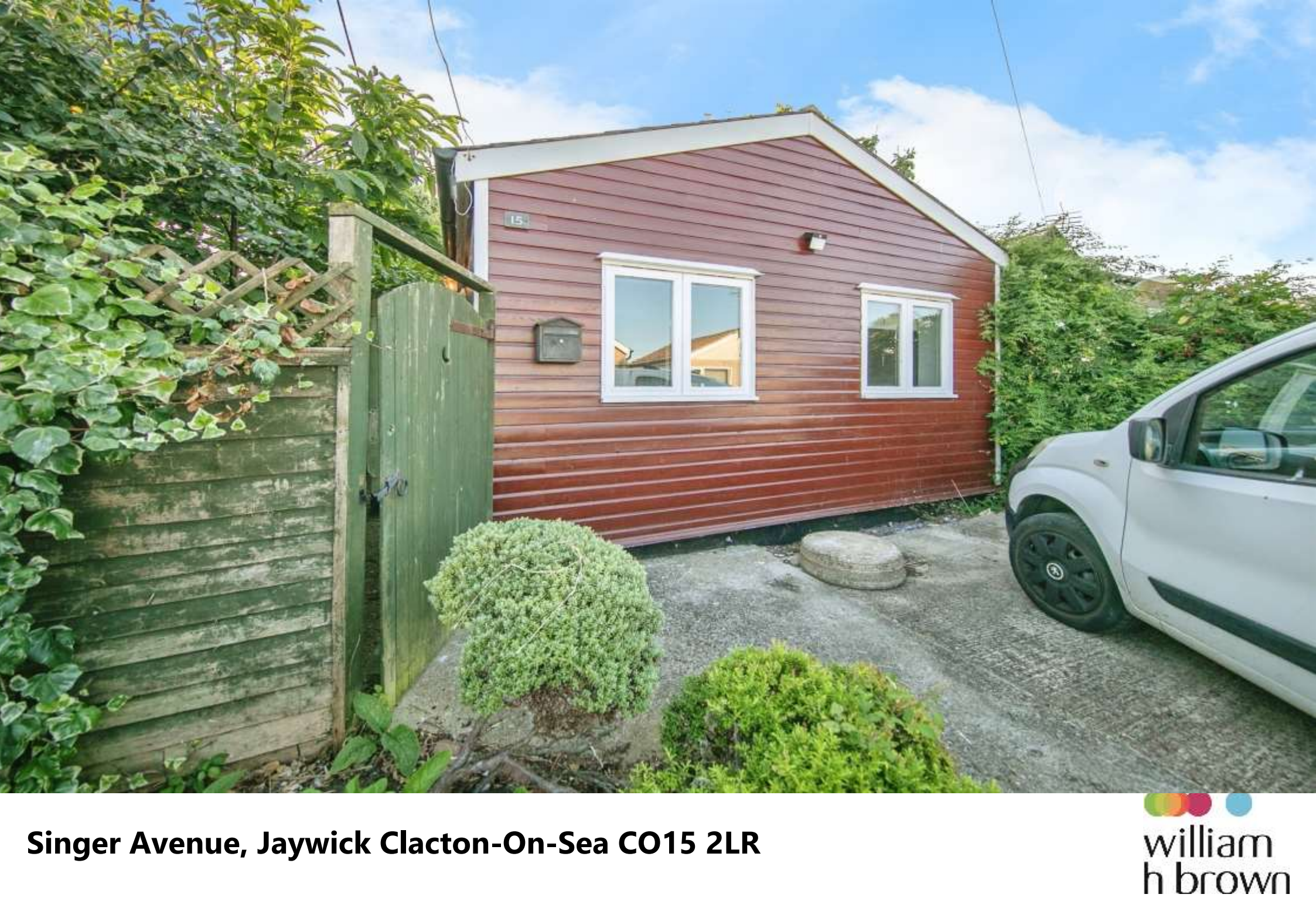
Singer Avenue, Jaywick Clacton-On-Sea CO15 2LR