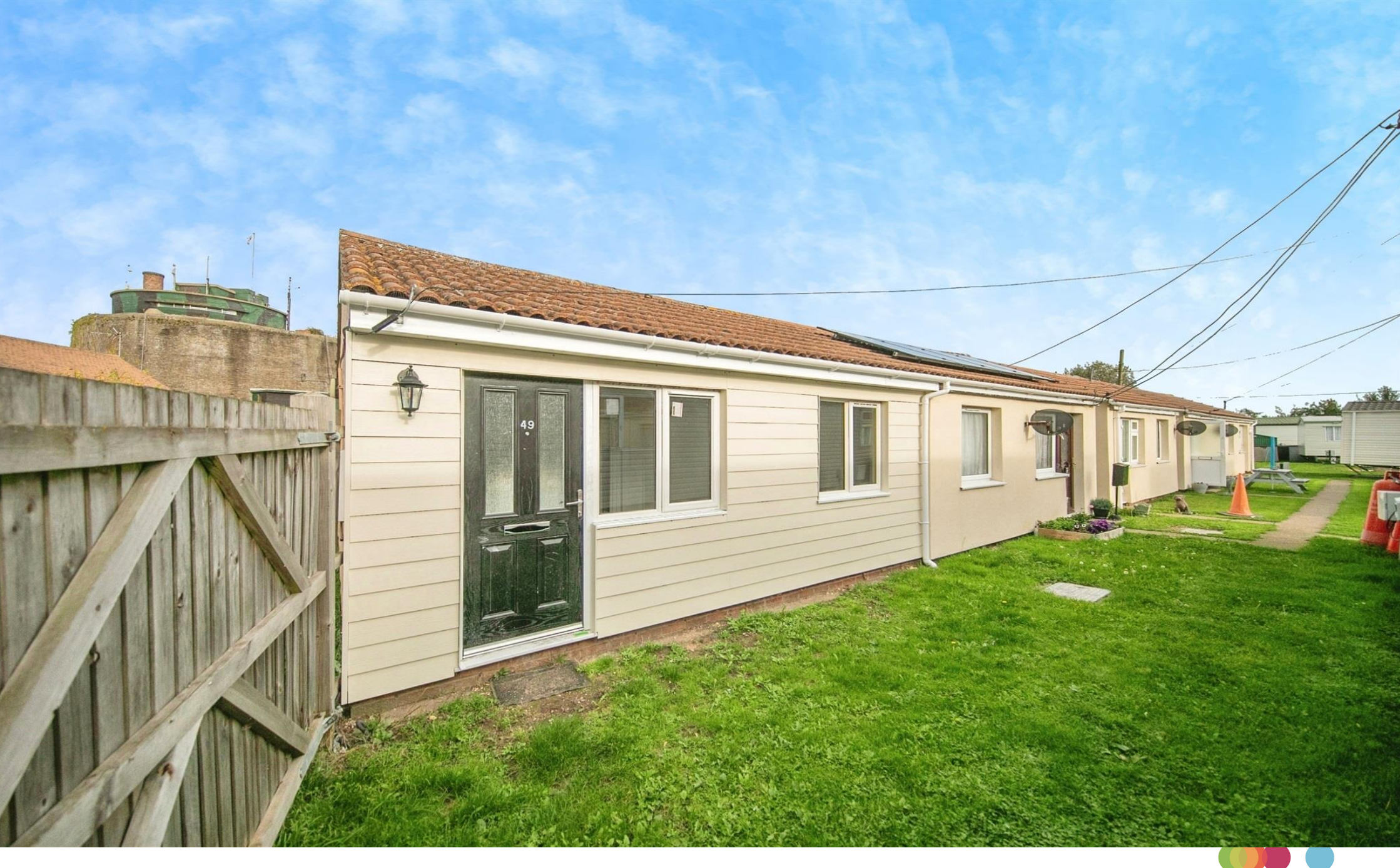
Tower Estate, Point Clear Bay Clacton-On-Sea CO16 8NG