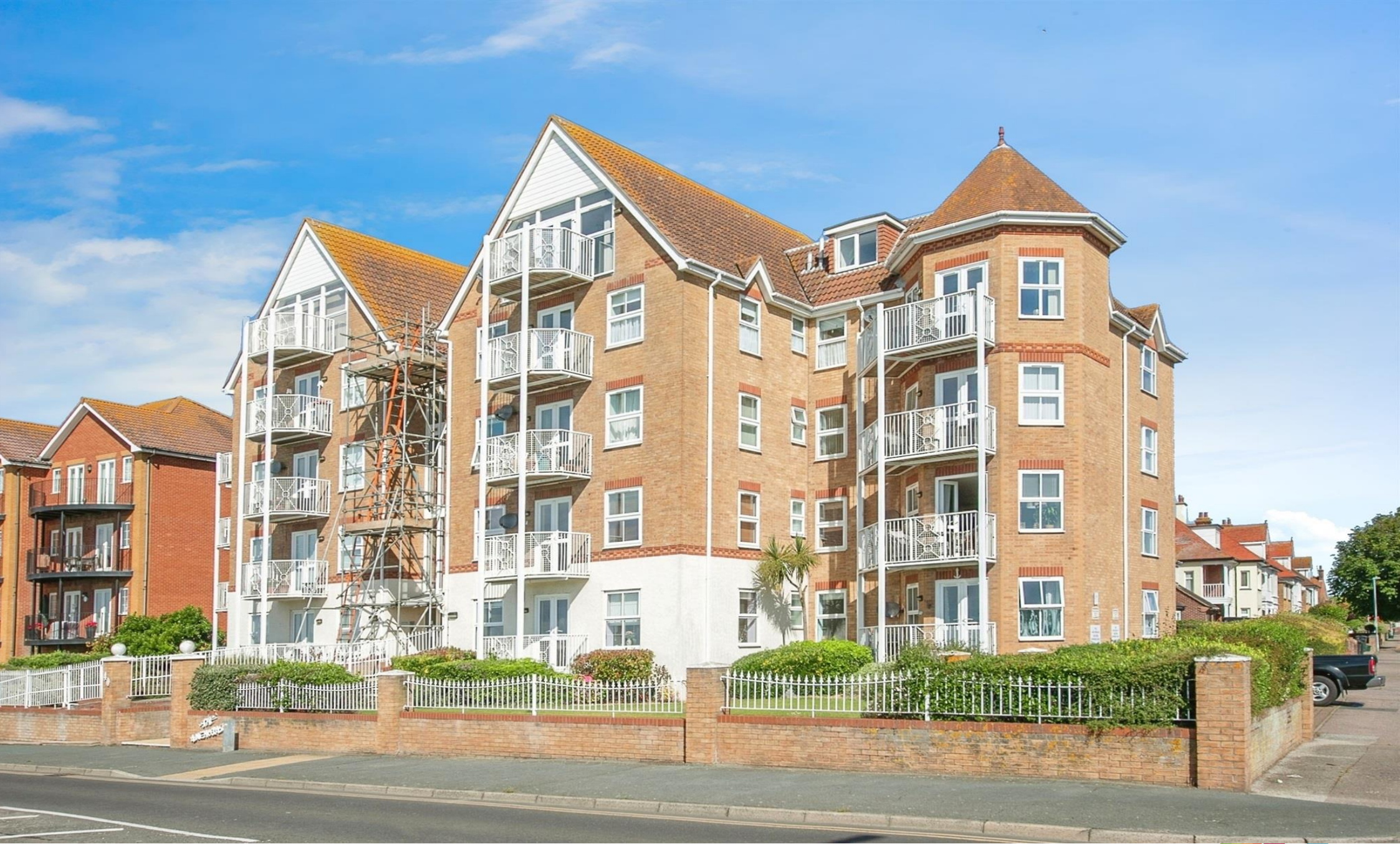
The Anchorage Marine Parade West, Clacton-On-Sea CO15 1LT