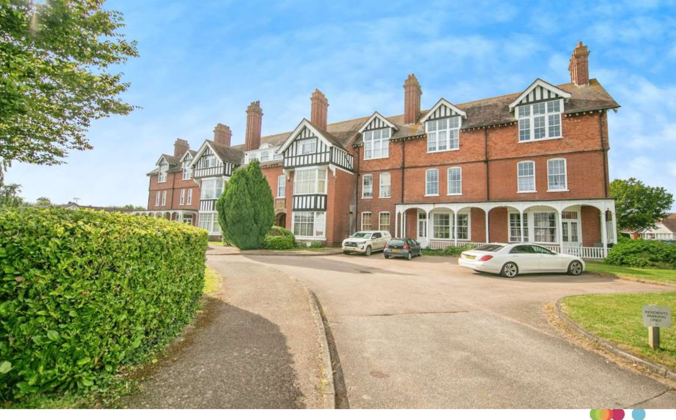
Middlesex Court Lyon Close, Clacton-On-Sea CO15 6EF