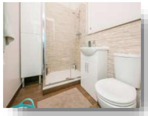
Walton Rd Walton Rd