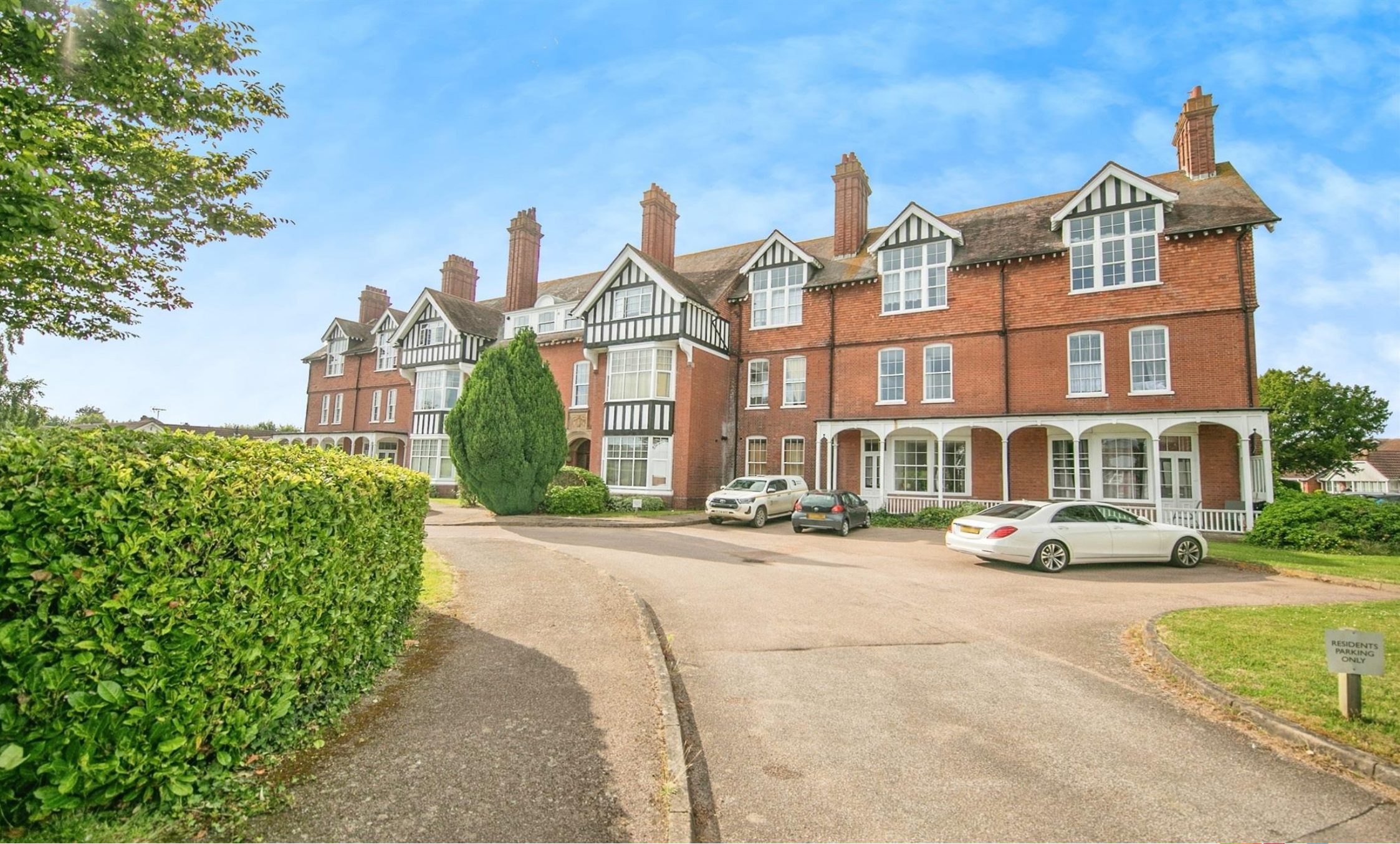
Middlesex Court Lyon Close, Clacton-On-Sea CO15 6EF