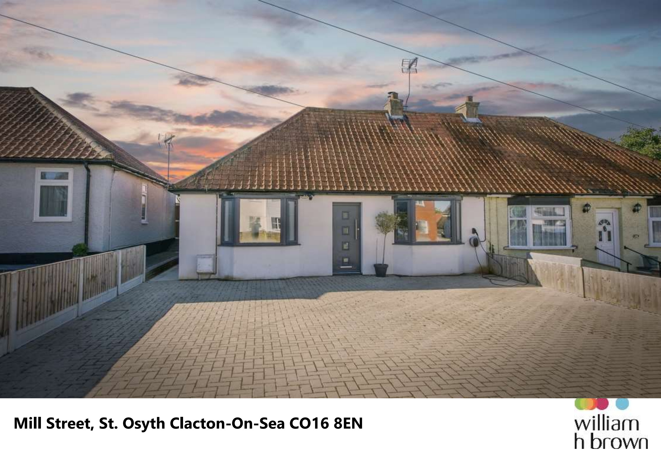
Mill Street, St. Osyth Clacton-On-Sea CO16 8EN