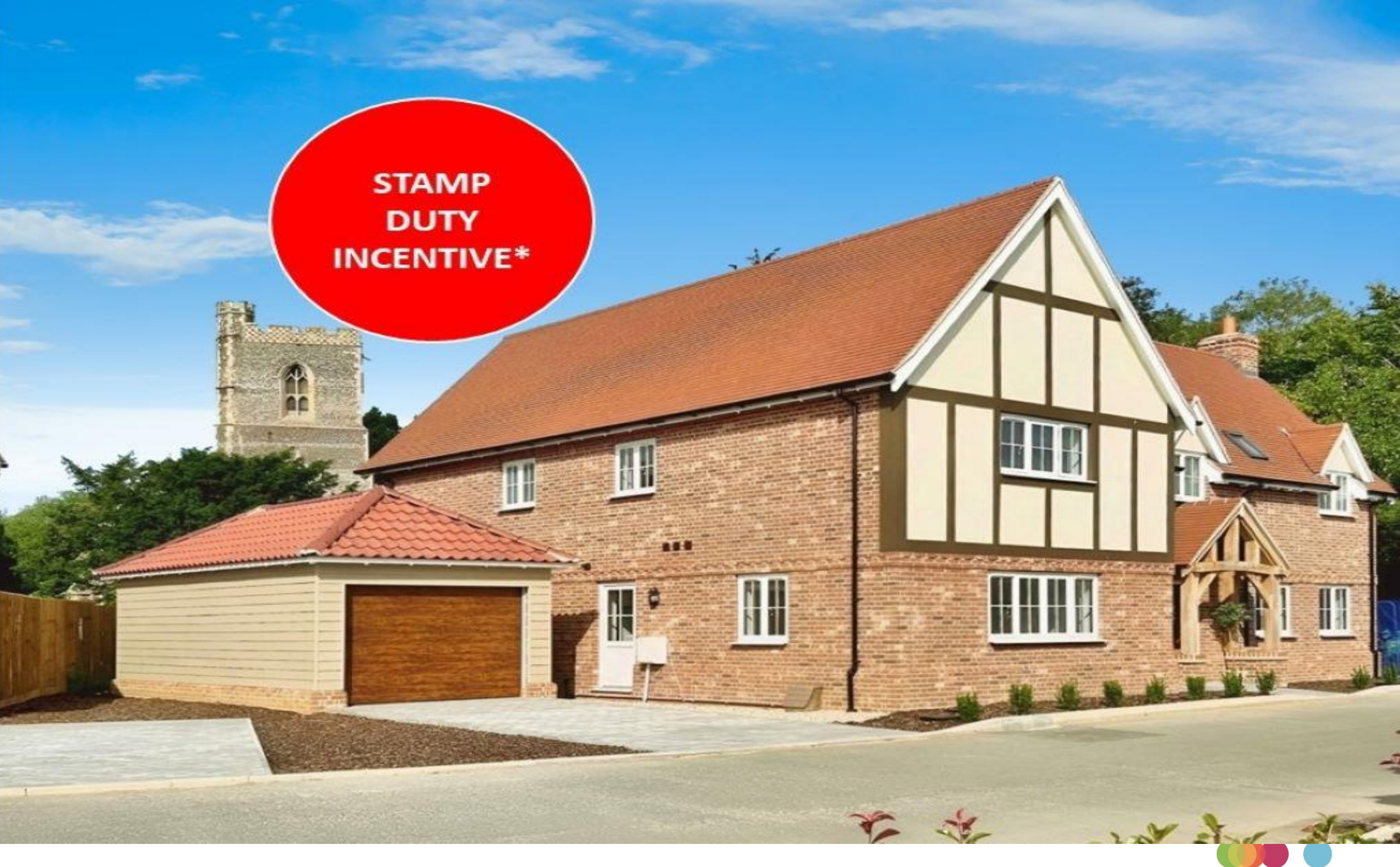
Tamarisk Close, Kirby-Le-Soken Frinton-On-Sea CO13 0EE