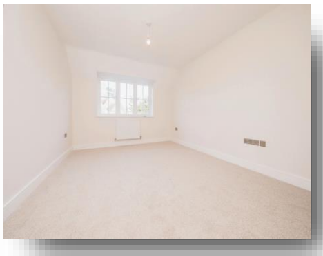
view this property online williamhbrown.co.uk/Property/CTS309534