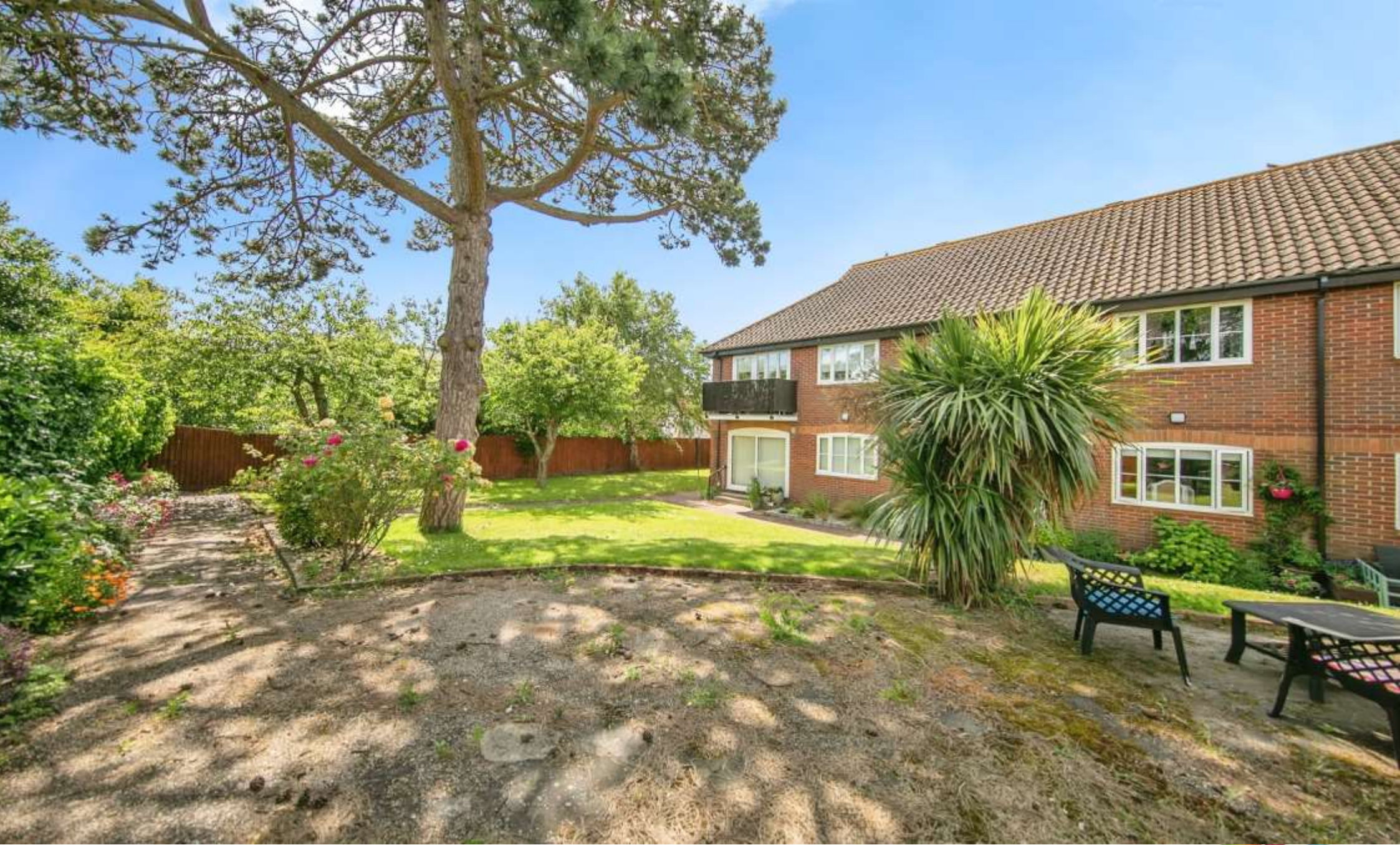
Elizabeth Court Louise Close, Walton On The Naze CO14 8LH