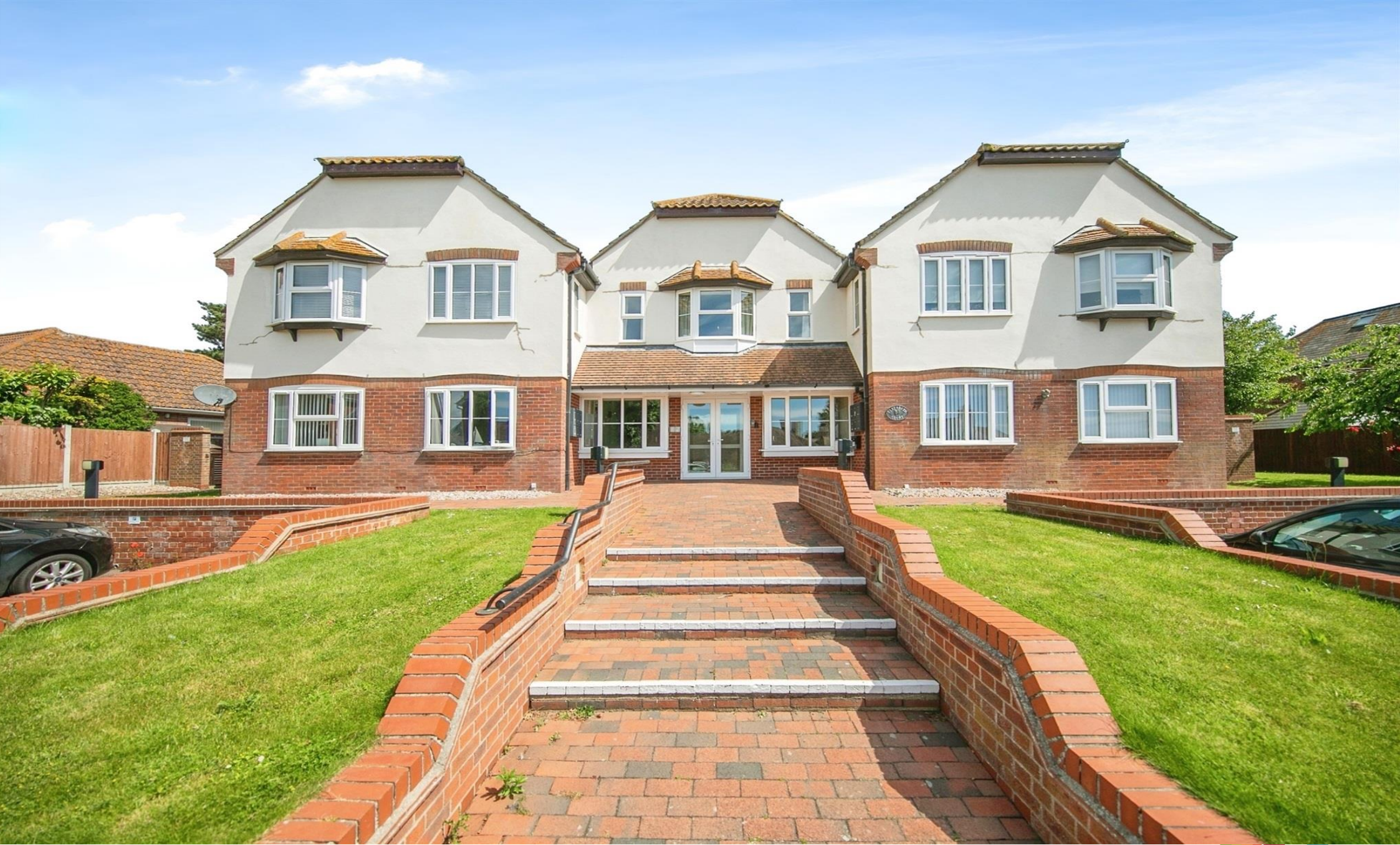
Elizabeth Court Louise Close, Walton On The Naze CO14 8LH