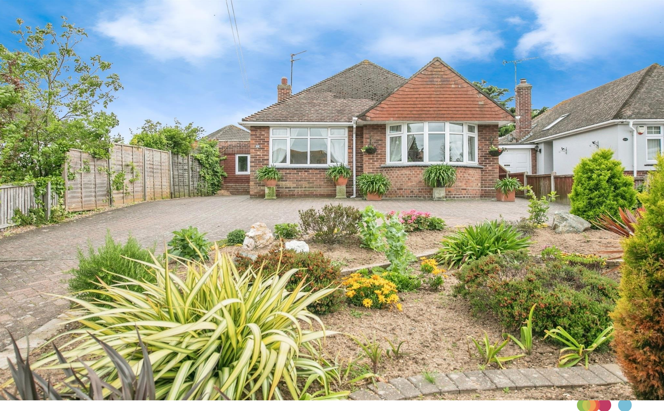
Holland Road, CLACTON-ON-SEA CO15 6NL