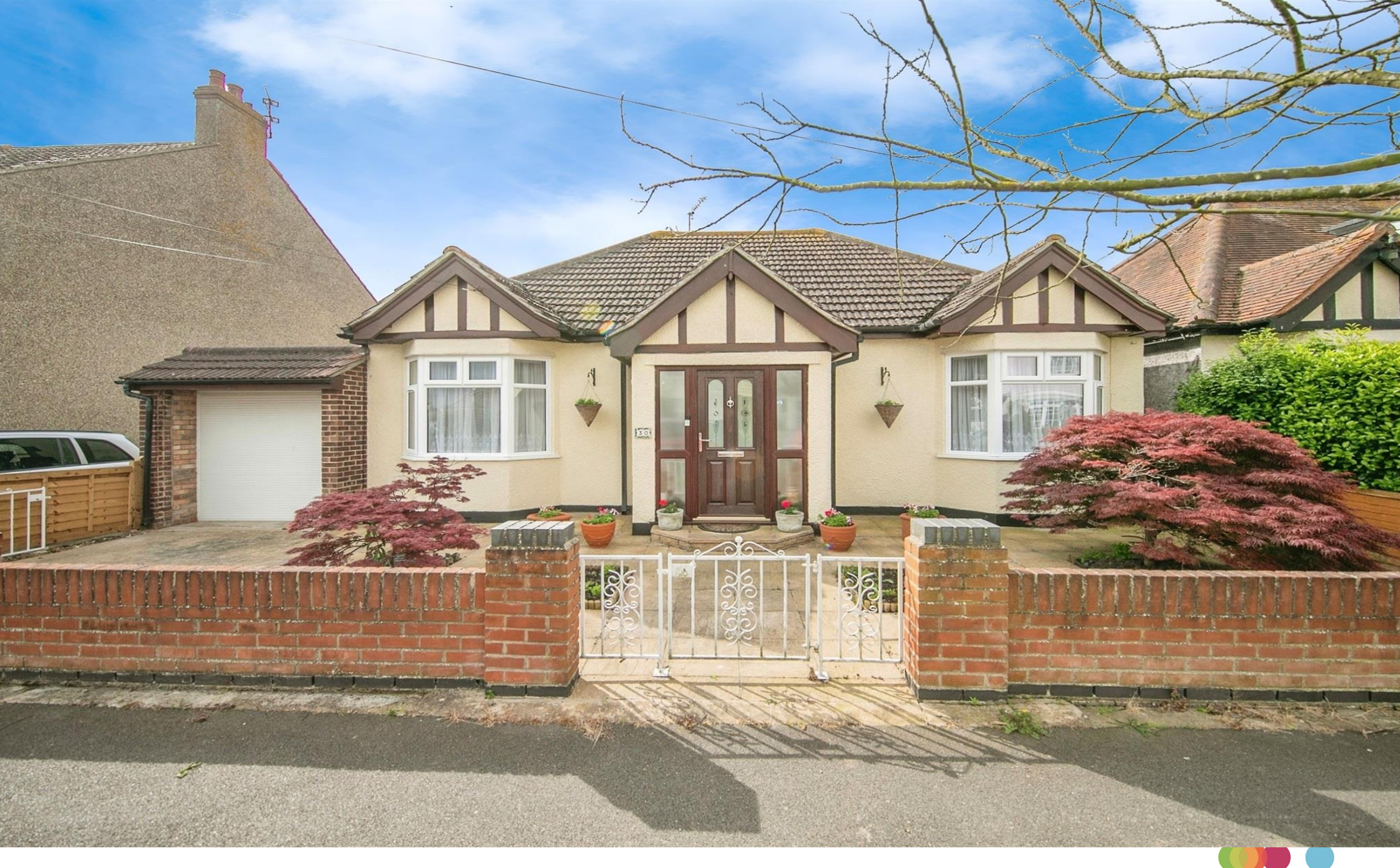
Bedford Road, Holland-On-Sea Clacton-On-Sea CO15 5LF