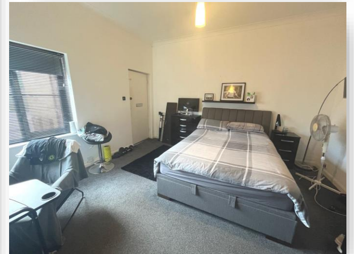
Waypond Court Wellesley Road, Clacton-On-Sea CO15 3PW