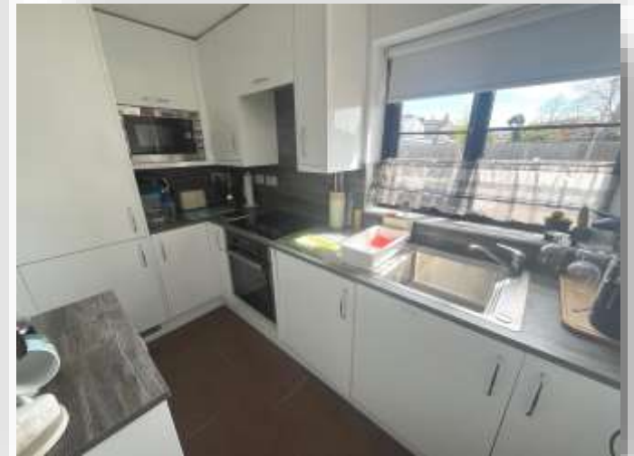
Waypond Court Wellesley Road, Clacton-On-Sea CO15 3PW