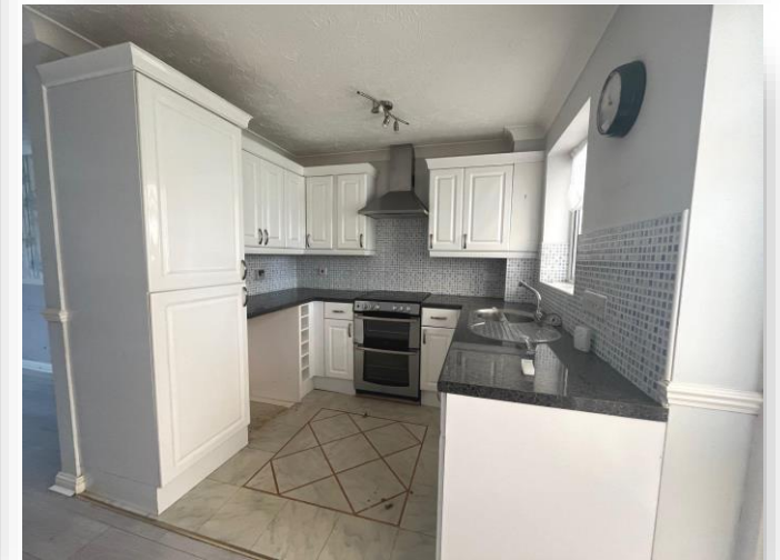
Weymouth Close, Clacton-On-Sea CO15 1BS