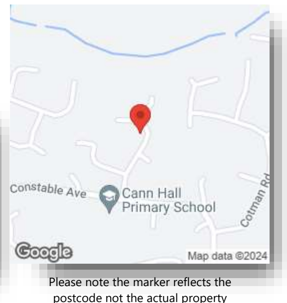
view this property online williamhbrown.co.uk/Property/CTS307336