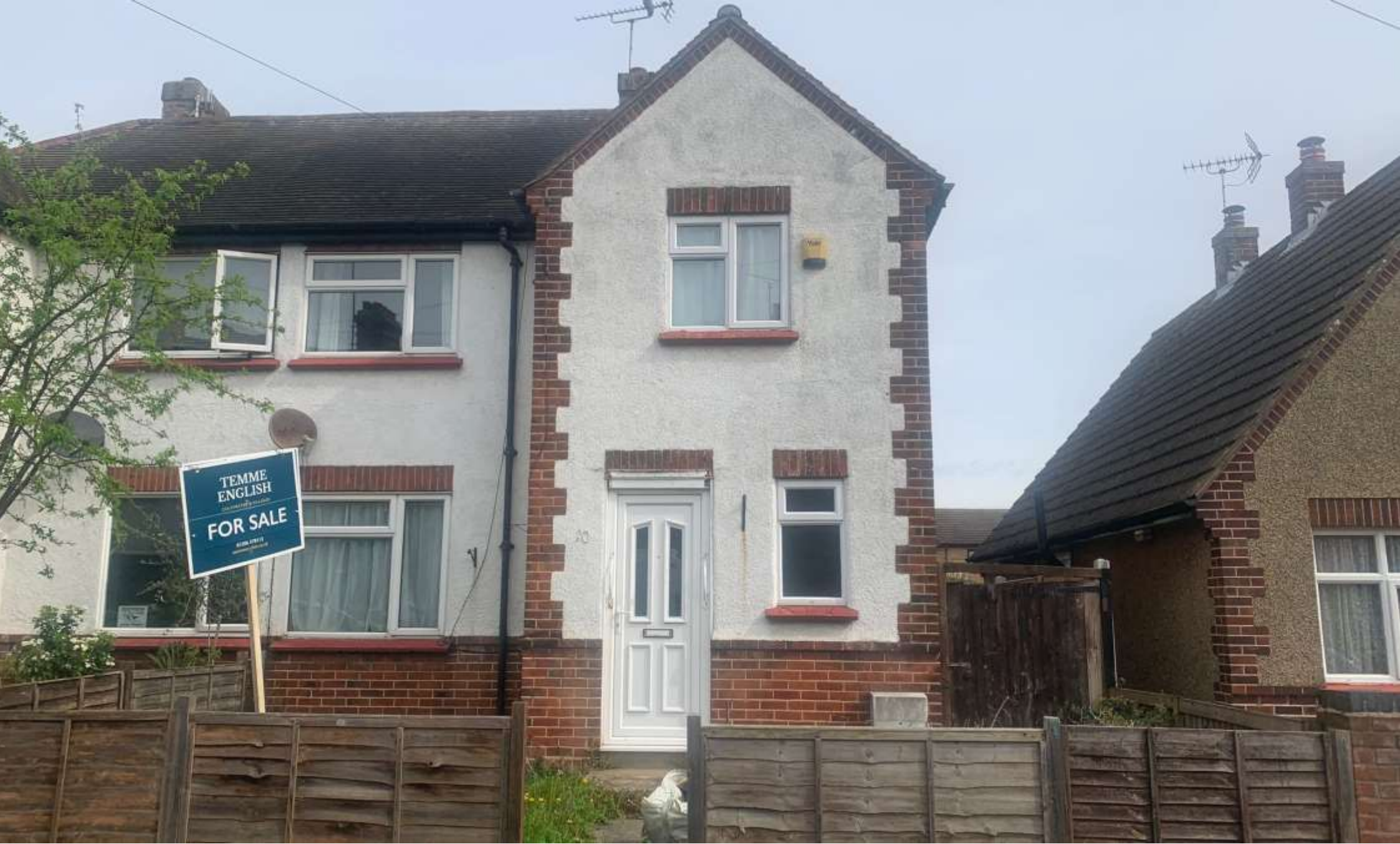
Knox Road, Clacton-On-Sea CO15 3SH