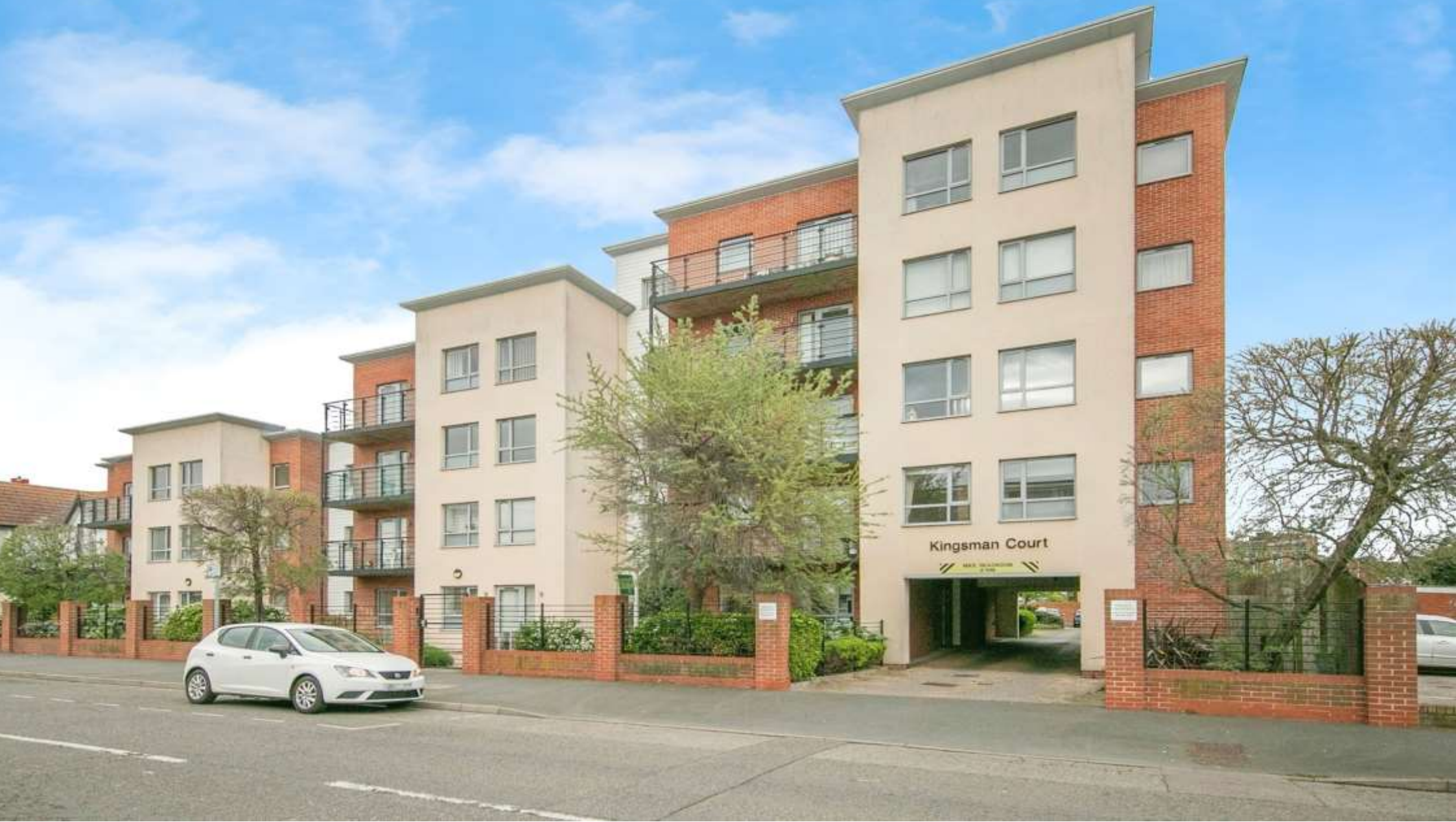
Kingsman Court Carnarvon Road, Clacton-On-Sea CO15 6EE