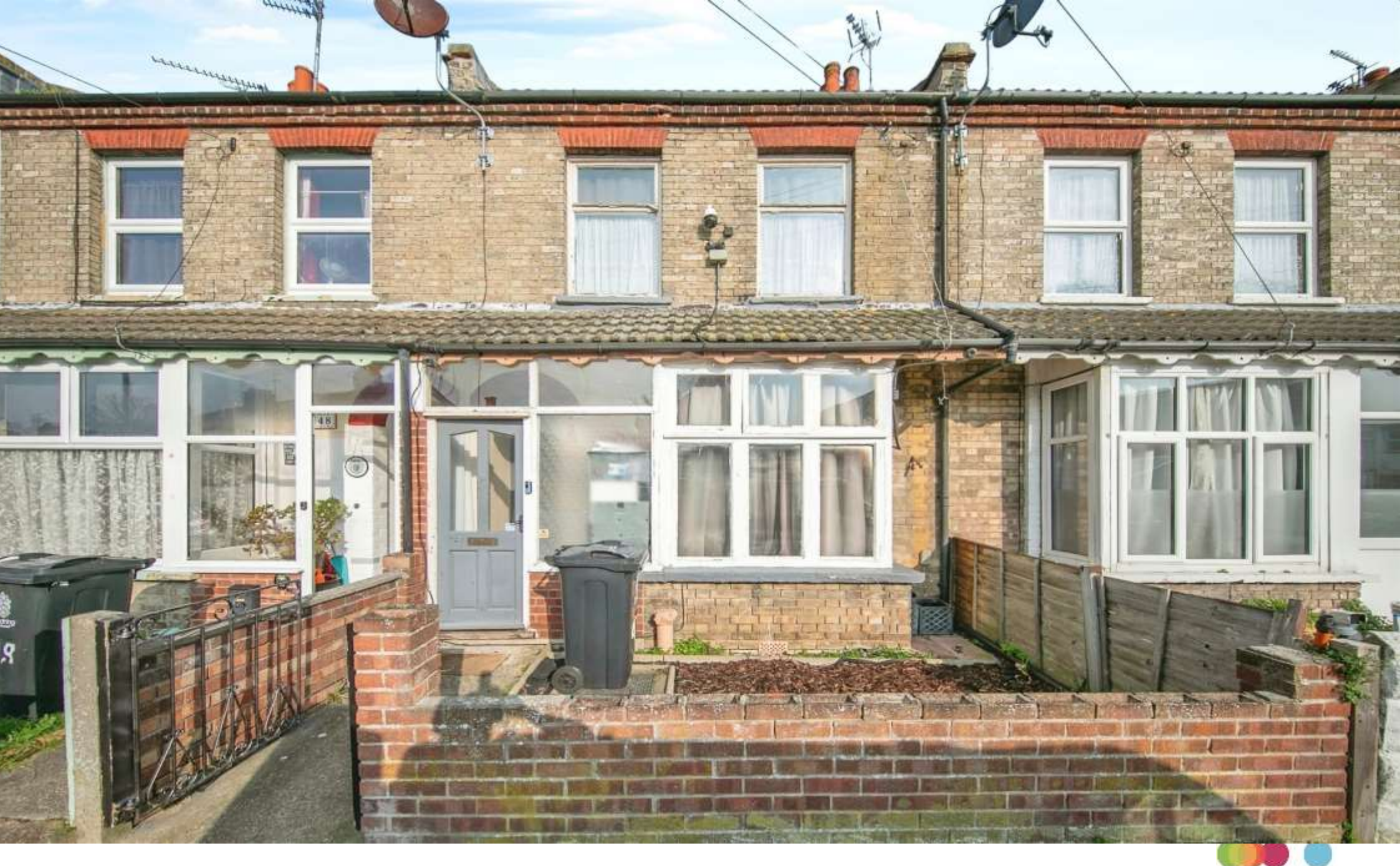
Oxford Crescent, Clacton-On-Sea CO15 3PY