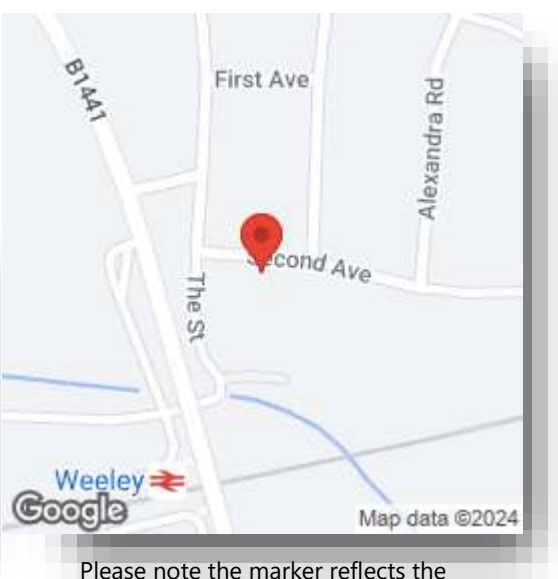
postcode not the actual property

view this property online williamhbrown.co.uk/Property/CTS309042