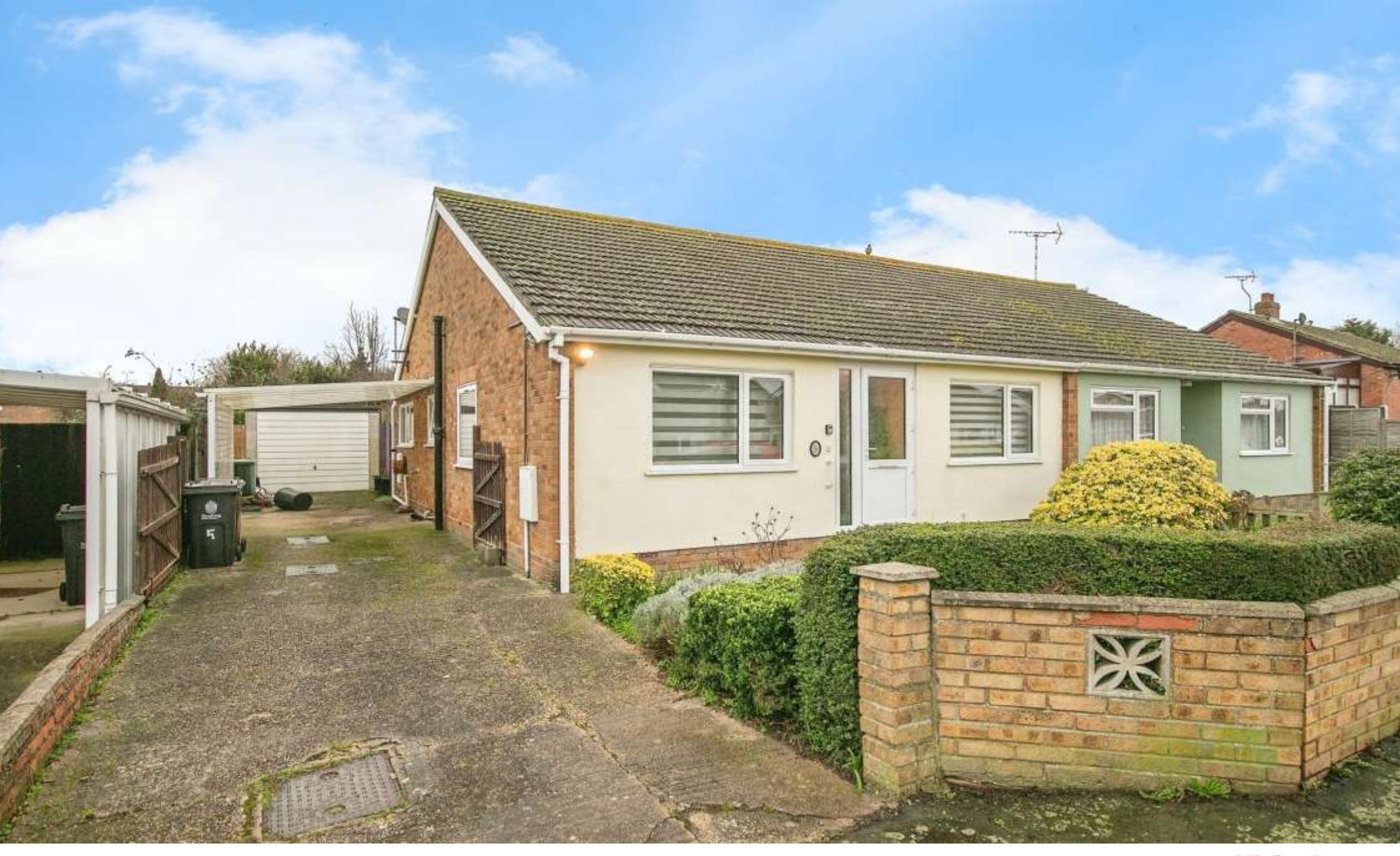
Second Avenue, Weeley Clacton-On-Sea CO16 9HT