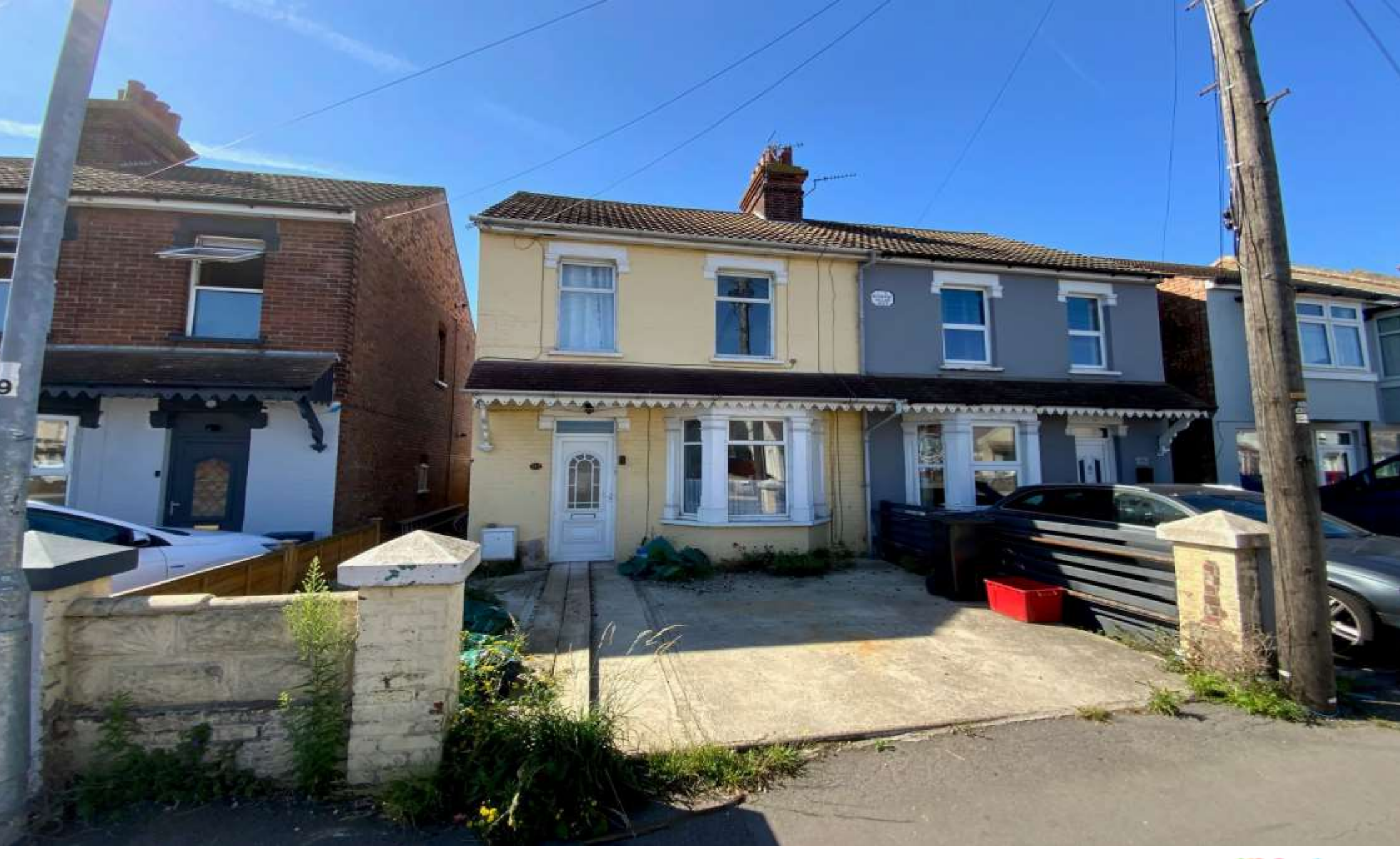
St. Osyth Road, Clacton-On-Sea CO15 3HD