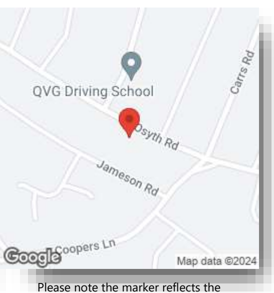
Please note the marker reflects the postcode not the actual property