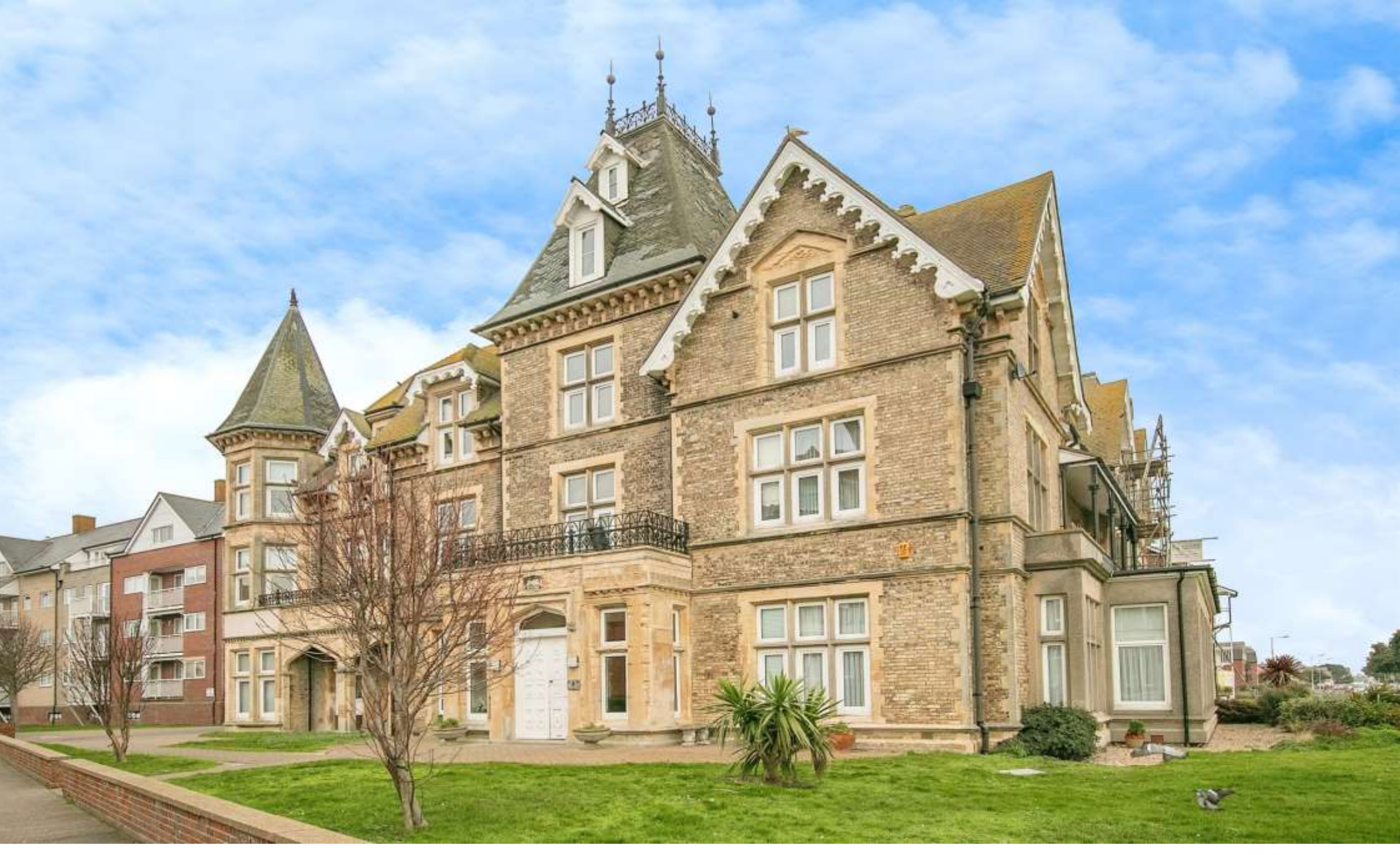
The Towers Vista Road, Clacton-On-Sea CO15 6BY