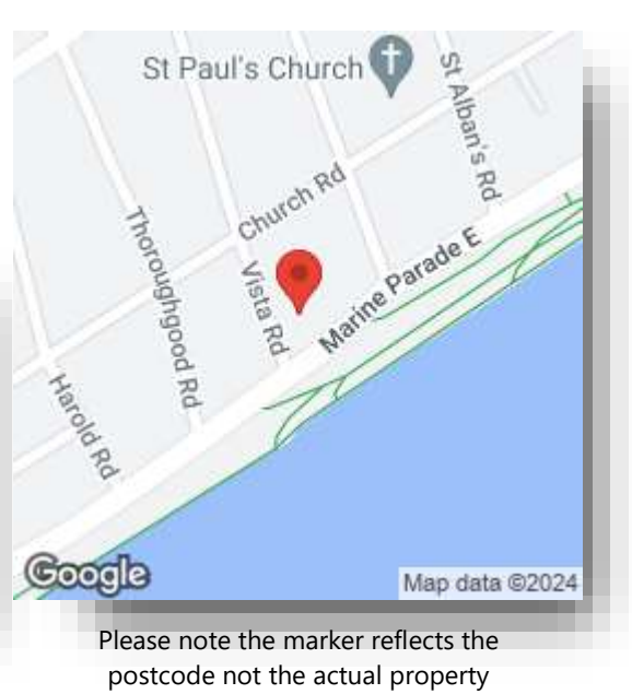
view this property online williamhbrown.co.uk/Property/CTS309187