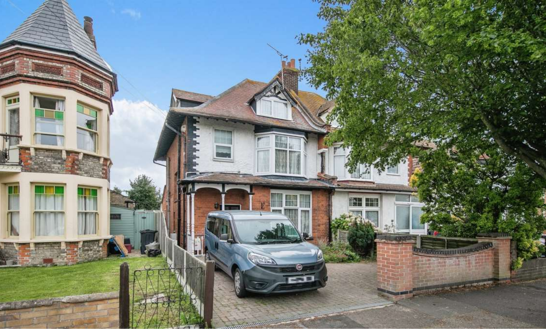
Vista Road, Clacton-On-Sea CO15 6AT