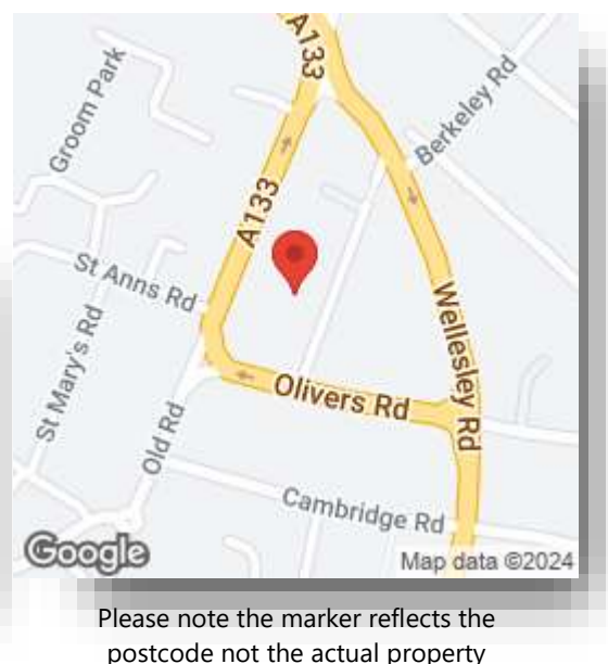
view this property online williamhbrown.co.uk/Property/CTS308512