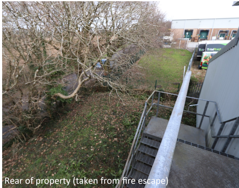
Rear of property (taken from fire escape)