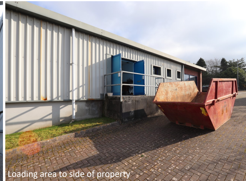
Loading area to side of property