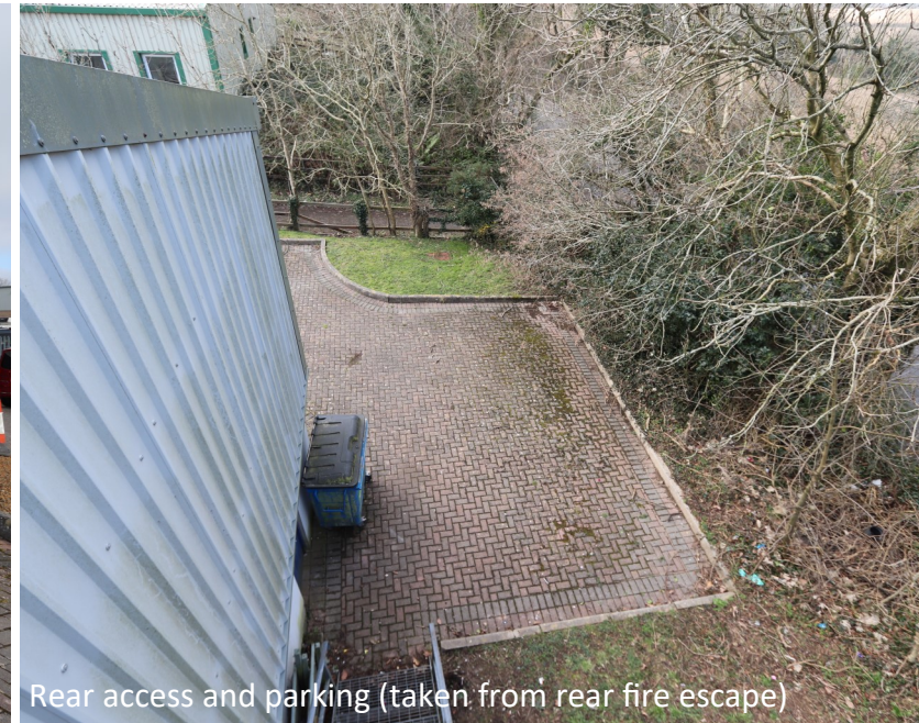
Rear access and parking (taken from rear fire escape)