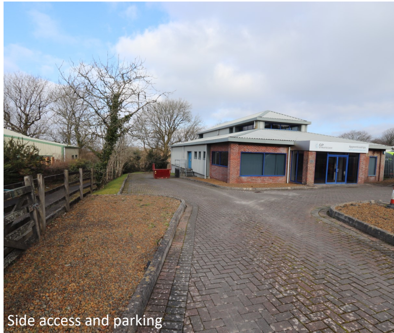
Side access and parking

Bodmin boasts the following amenities and nearby services : Independent shops and national chains, sports pitches and a leisure centre, primary, secondary and six form educational facilities, expanding residential and commercial developments and good local restaurants and pubs. The Camel Trail is easy to access from Bodmin Town Centre (only 1.8 miles away). Bodmin Moor, Roughtor and Cardinham Woods are nearby and offer numerous walking opportunities.