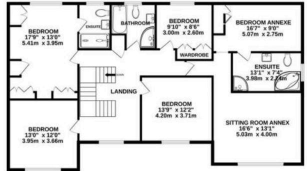
1ST FLOOR 1528 sq.ft. (142.0 sq.m.) approx.