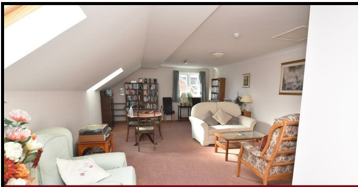
Communal Library / Reading Room