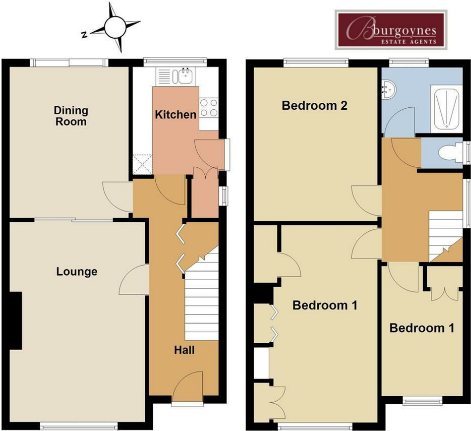
Ground Floor First Floor Total area: approx. 92.9 sq. metres (1000.3 sq. feet) Please note that whilst every attempt has been made to ensure the accuracy of this plan, all measurements are approximate and not to scale. This floor plan is for illustrative purposes only and no responsibility is accepted for any other use. 1 Linda Close, Exeter

These particulars, whilst believed to be accurate are set out as a general outline only for guidance and do not constitute any part of an offer or contract. Intending purchasers should not rely on them as statements of representation of fact, but must satisfy themselves by inspection or otherwise as to their accuracy. No person in this firms employment has the authority to make or give any representation or warranty in respect of the property.