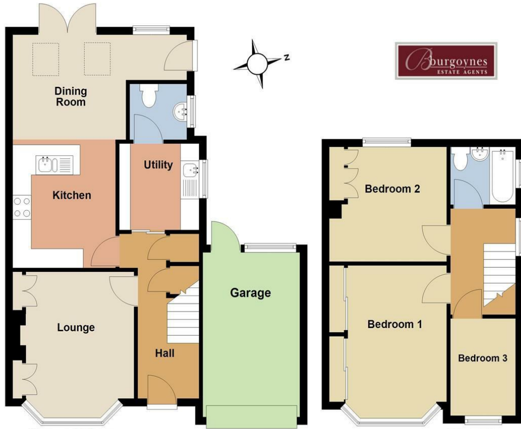
Ground Floor Total area: approx. 93.3 sq. metres (1004.7 sq. feet) First Floor

Please note that whilst every attempt has been made to ensure the accuracy of this plan, all measurements are approximate and not to scale. This floor plan is for illustrative purposes only and no responsibility is accepted for any other use.