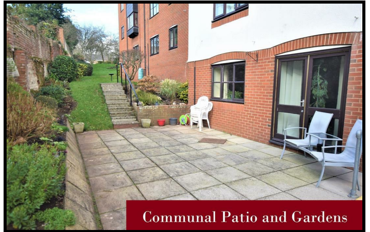
Communal Patio and Gardens